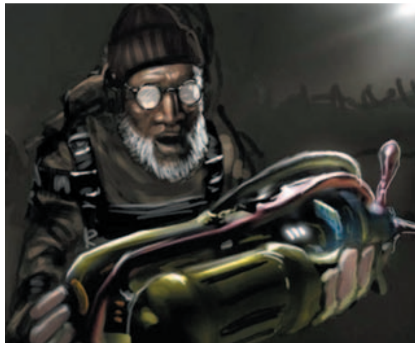
An early concept sketch of Eli Vance with prototype physics manipulator.