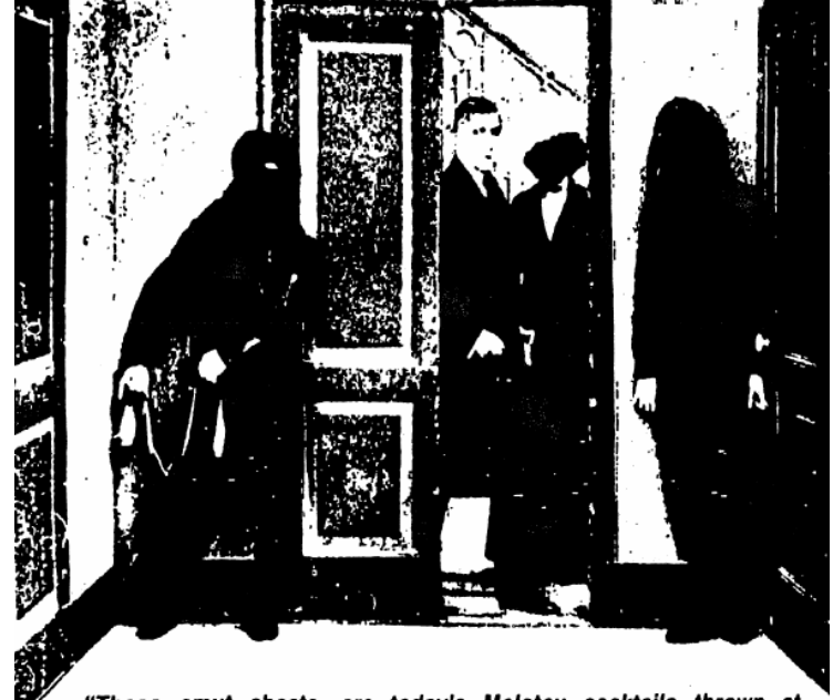
"These smut sheets, are today's Molotov cocktails thrown at respectability and decency in our nation... They encourage depravity and irresponsibility, and they nurture a breakdown in the continued capacity of the government to conduct an orderly and constitutional society." Rep. Joe Pool (House Un-American Activities Committee)

BLACK MASK - whose real axis was still essentially abstract and ethereal: a magazine - dissolved itself and a hard core of some 20 odd people reformed as the Lower East Side SDS chapter(!): UP AGAINST THE WALL MOTHERFUCKER... AND INTO THE TRASHCAN... The first thing they really got their teeth into was the Lower East Side Garbage Strike. As a metaphor the giant rat-infested heaps of rotting garbage were a godsend: now no one could, or would, shift the shit out of sight any more. Not only were they up against the wall - they were, quite literally, in the trashcan. From street to street they fired the spread-eagled mounds, drank and danced round them and when the firemen finally arrived (there was a big Firemen's Strike at the same time) climbed on to the tenement roofs (roofs, like sewers, major unpatrolled zones) and lobbed bricks, slates and anything else to hand down on them to cries of 'black-legs'. Unwashed and ragged, dancing, singing, ham-