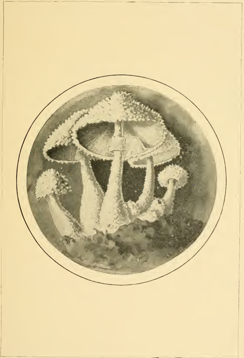
Agaricus (Lepiota) cepaestipes —var. cretaceus , Peck. ( Lepiota cretacea .)