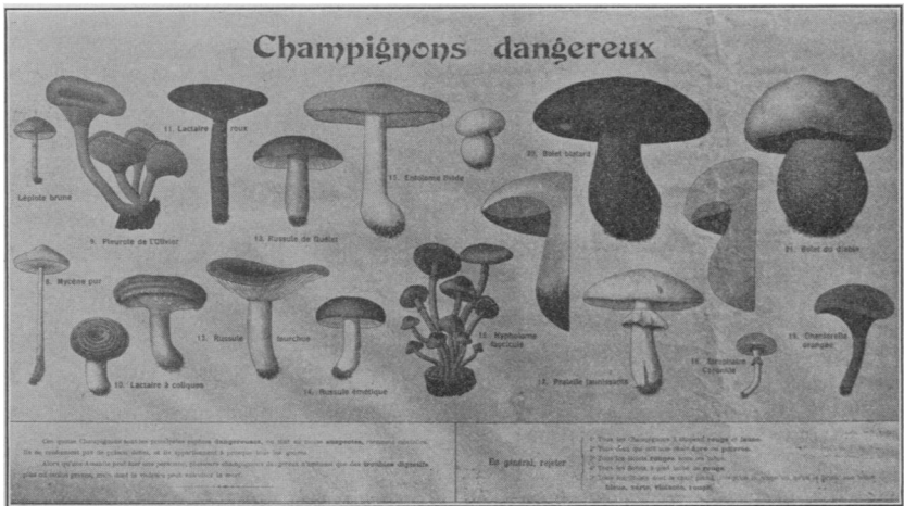
FIG. 2. French chart showing species considered dangerous.

An account of the poisonous effects of this species was published in MYCOLOGIA for September, 1909. It has since been col-