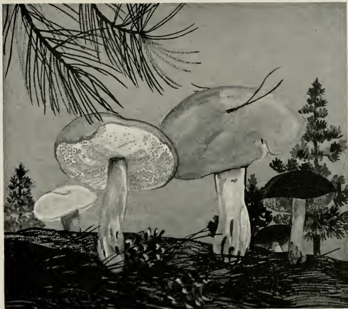
l. to r.: Yellow Boletus ( Boletus luteus ); Two-colored Boletus ( B. bicolor ). Edible. Summer, autumn. 2/3 nat. size.