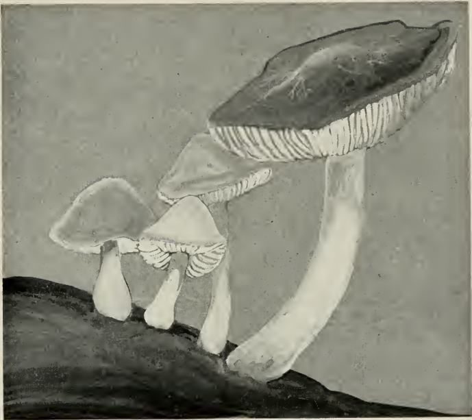
Fawn-colored Pluteus ( Pluteus cervinus ). Edible. Autumn. \frac{3}{4} nat. size.