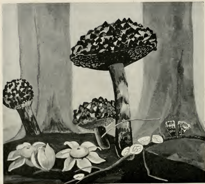
Bottom: l. to r.: Earth Star ( Geaster hygrometricus ) Birds' Nests ( Crucibulum vulgare and Cyathus striatus ). Top: Pine-cone Mushroom ( Strobilomyces strobilaceus ). \frac{1}{2} nat. size. Edible. Autumn.