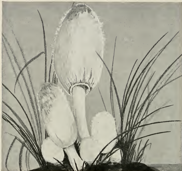
Shaggy Manes ( Coprinus comatus ). Edible. Late summer, autumn. \frac{3}{4} nat. size.