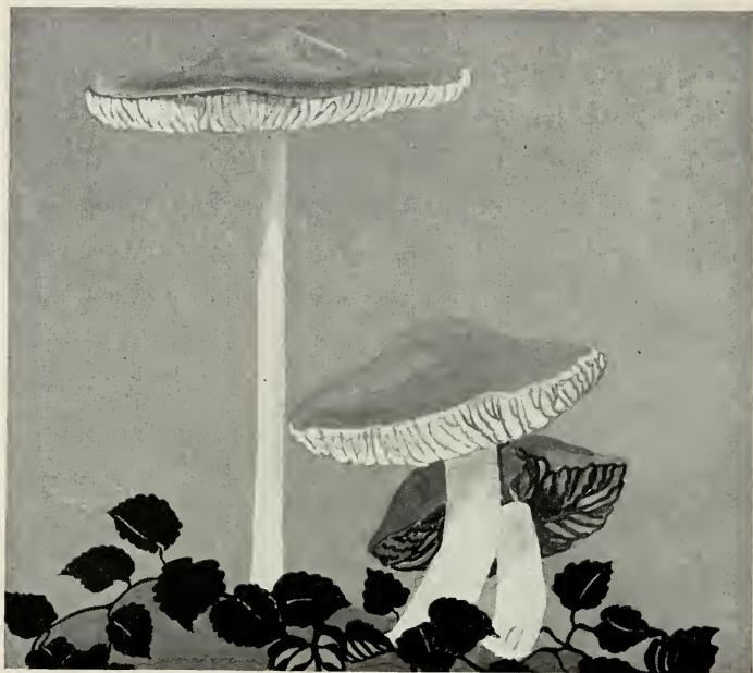
1. to r.: Rooting Collybia ( C. radicata ); Broad-Gilled Collybia ( C. platyphylla ). Edible. Summer. \frac{1}{2} nat. size.