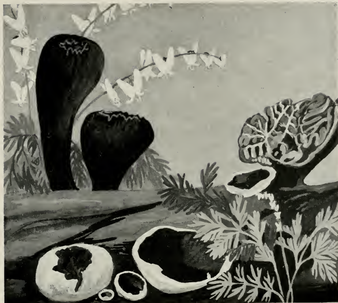
Top: Black Urnula ( Urnula craterium ). Bottom: Scarlet Cups ( Peziza coccinea ). Right: Jew's Ear ( Hirneola auricula-judae ). Non-poisonous. Spring. 2/3 nat. size.