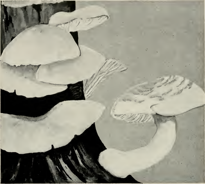
Oyster Mushrooms ( Pleurotus ostreatus and P. ulmarius ). Edible. Summer, autumn. \frac{1}{2} nat. size.