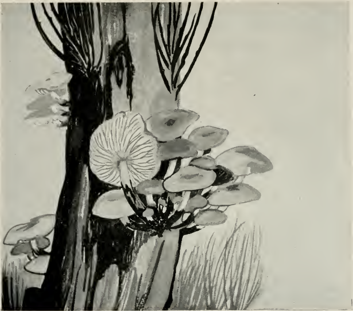
Velvet Stems ( Collybia velutipes ). Edible. Autumn, winter. 2/3 nat. size.