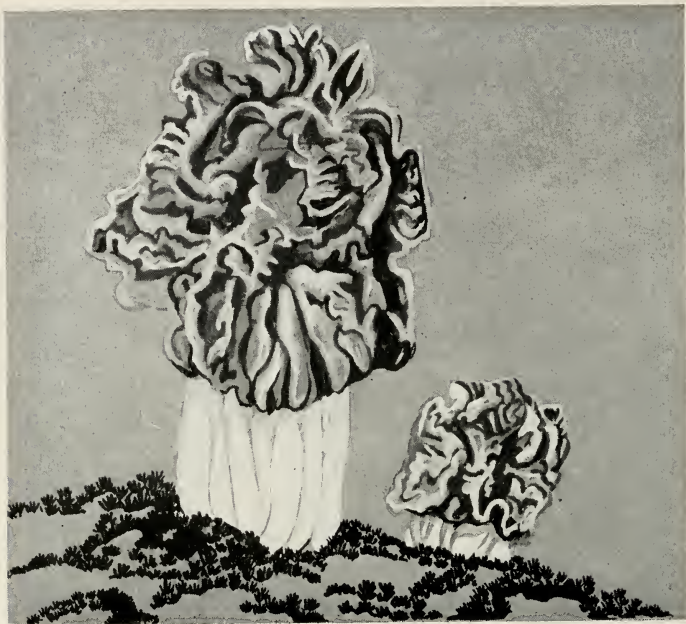
Gyromitra. ( Gyromitra esculenta ) Poisonous. Spring. \frac{1}{2} nat. size.