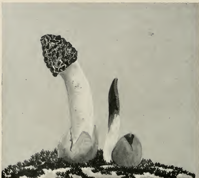
Stinkhorn ( Phallus impudicus ); Orange Stinkhorn ( Mutinus caninus ). Not edible. Summer. \frac{2}{3} nat. size.