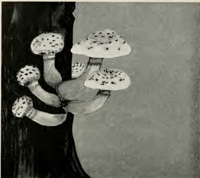
Fat Pholiota ( Pholiota adiposa ). Edible. Autumn. \frac{2}{3} nat. size.