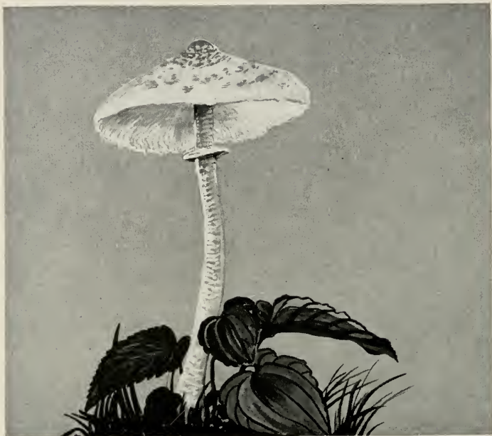
Common Parasol Mushroom ( Lepiota procera ). Edible. Summer, autumn. \frac{1}{2} nat. size.