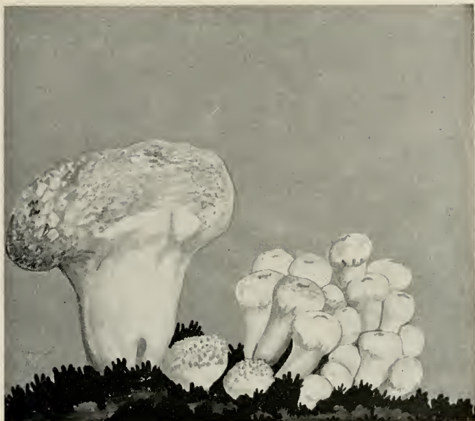
l. to r.: Brain Puffball ( Calvatia craniiformis ); Gemmed Puffball ( Lycoperdon gemmatum ); Pear Puffball ( Lycoperdon pyriforme ). Edible. Summer, autumn. \frac{1}{2} nat. size.