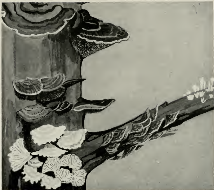
Top to bottom: Daedalia quercina ; Polyporus cinnabarinus ; Schizophyllum commune . Right: Polystictes and Guepinia . Non-poisonous. \frac{1}{2} nat. size.