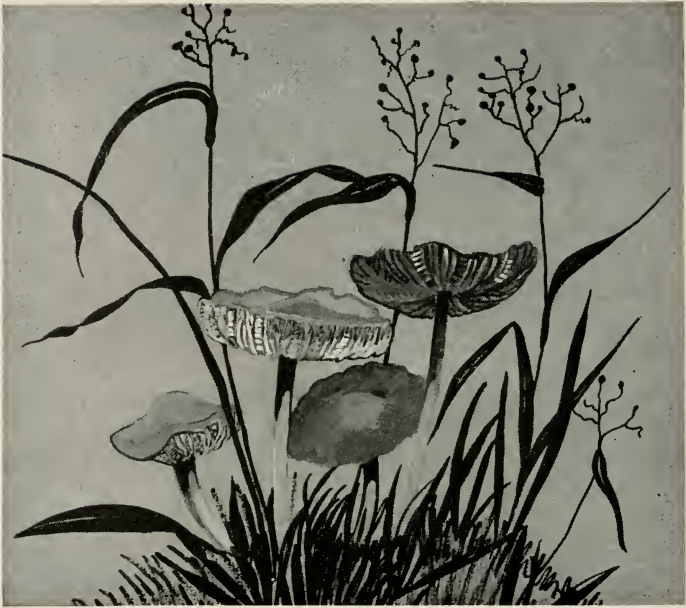
Fairy Ring ( Marasmius oreades ). Edible. Summer. Natural size.