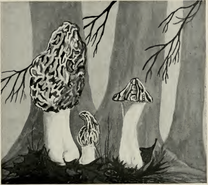
Morels. l. to r.: Morchella esculenta , Morchella semilibera . Edible. Spring. 2/3 nat. size.