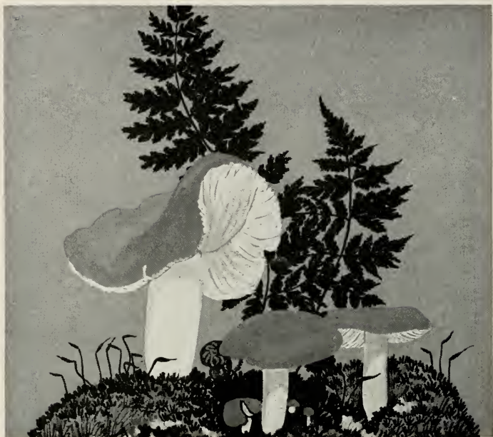
l. to r.: Purple Russula ( Russula purpurina ), Inch Russula ( R. uncialis ). Edible. Summer. Nat. size.