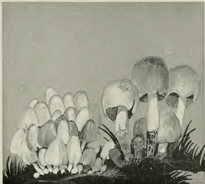
l. to r.: Mica Caps ( Coprinus micaceus ); Inky Caps ( Coprinus atramentarius ). Edible. Spring to autumn. 2/3 nat. size.