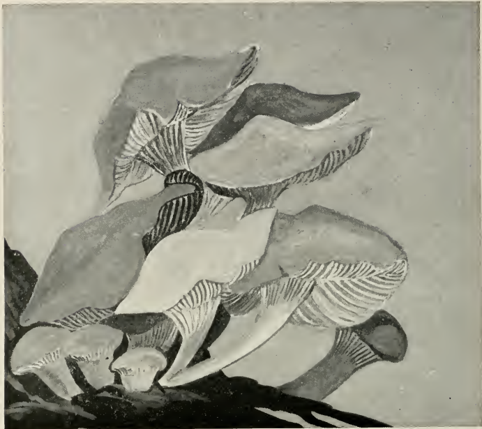
Jack o' Lantern Mushroom ( Clitocybe illudens ). Poisonous. Autumn. \frac{1}{2} nat. size.