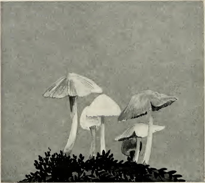
Uncertain Hypholoma ( Hypholoma incertum ). Edible. Summer. Nat. size.