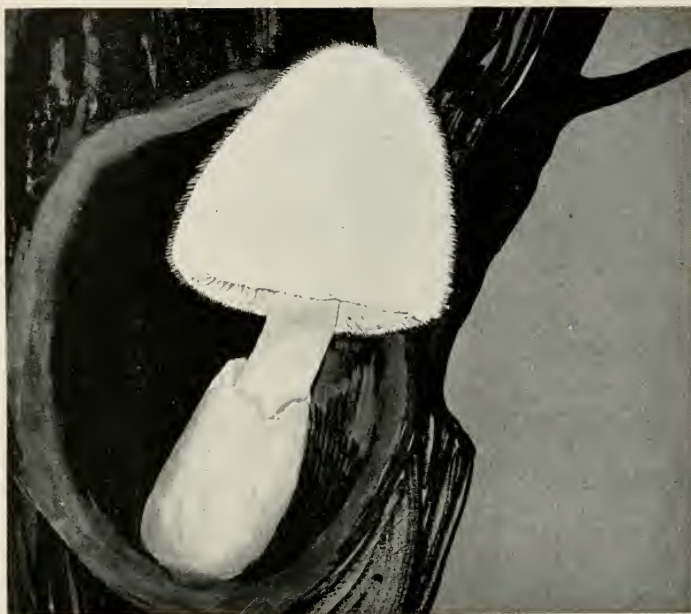
Silky Volvaria ( Volvaria bombycina ). Edible. Summer. \frac{3}{4} nat. size.