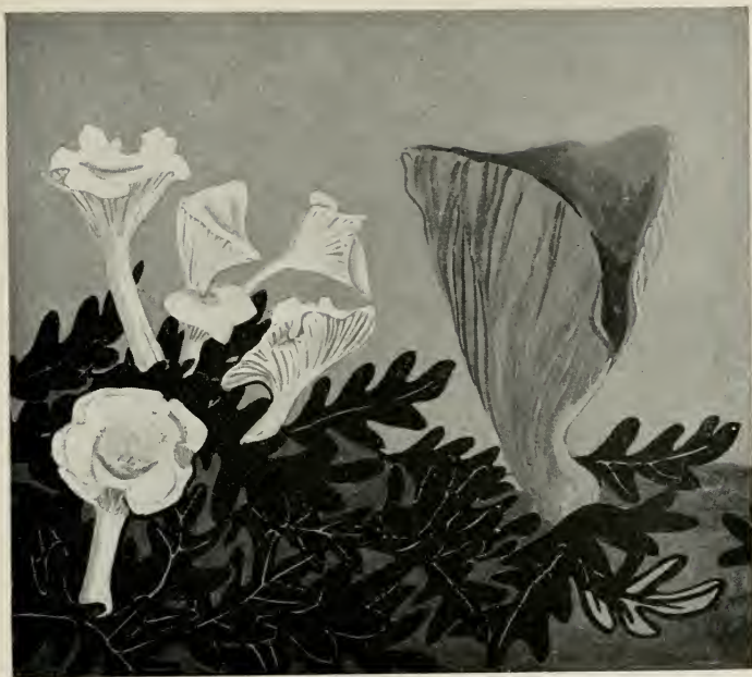
l. to r.: White Clitocybe ( Clitocybe candicans ); Chantarelle ( Cantharellus cibarius ). Edible. Summer. 2/3 nat. size.