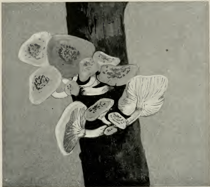
Honey Mushroom ( Armillaria mellea ). Edible. Summer, autumn. 2/3 nat. size.