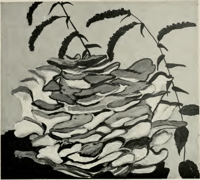
Leafy Polyporus. ( Polyporus frondosus ). \frac{1}{2} nat. size. Edible. Summer, autumn.