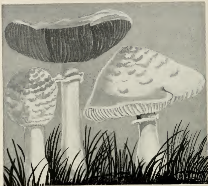
Three stages of Lepiota morgani . Poisonous. Summer, autumn. 2/3 nat. size.