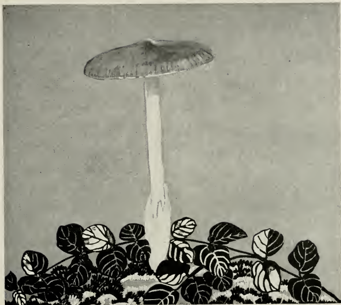
Amanitopsis vaginata . Non-poisonous. Summer. 2/3 nat. size.