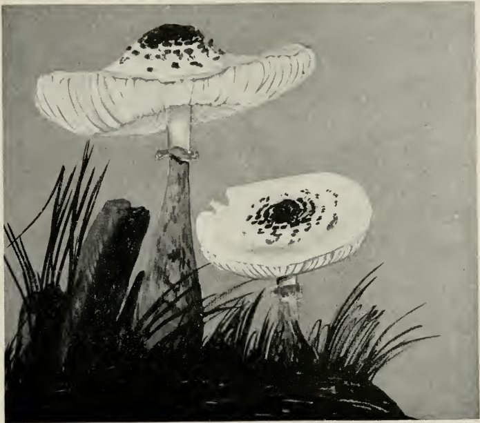
American Parasols ( Lepiota americana ). Edible. Summer. 2/3 nat. size.