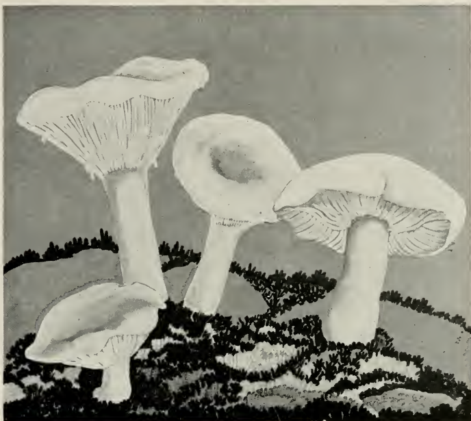
Left: Peppery Lactarius ( Lactarius piperatus ). Edible. Far right: White Tricholoma ( Tricholoma album ). Poisonous. Late summer, autumn. 2/3 nat. size.