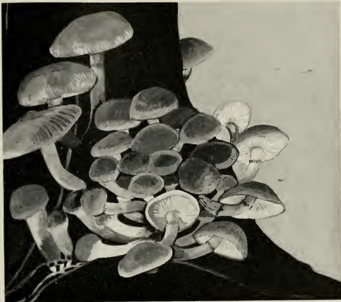
Brick Tops ( Hypholoma sublateritium ). Edible. Late autumn. 2/3 nat. size.