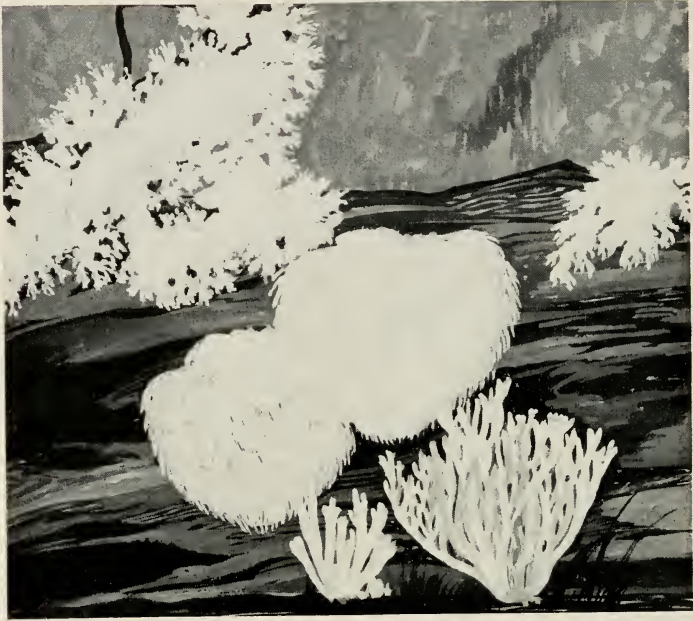
l. to r.: Coral Hydnum ( Hydnum laciniatum ), Hedgehog Hydnum ( Hydnum erinaceum ), Clavaria species. All edible. 1/3 nat. size.