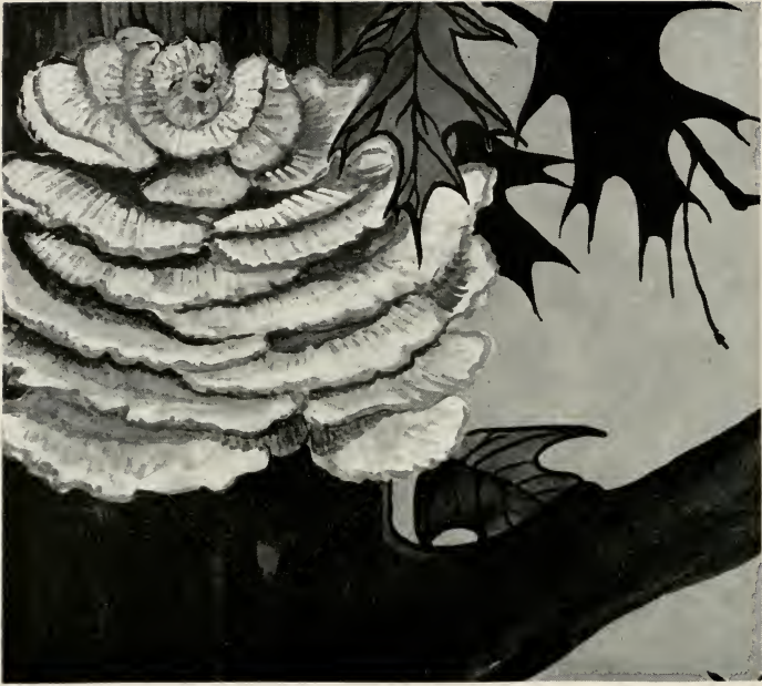
Sulphur Mushroom ( Polyporus sulphureus ). Edible. Summer, autumn. 1/3 nat. size.