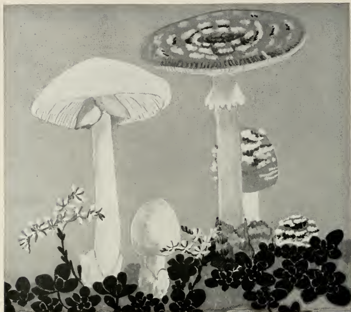
l. to r.: Spring Amanita ( Amanita verna ); Fly Amanita ( A. muscaria ). Deadly poisonous. Spring, summer. 2/3 nat. size.