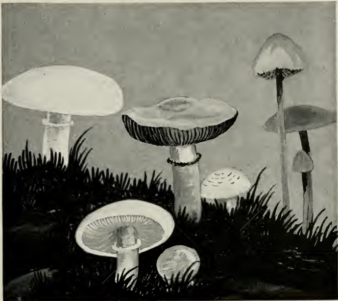
Pasture Mushrooms (five) ( Agaricus campestris ). Edible. Far right: ( Panaeolus campanulatus ). Poisonous. Summer, autumn. \frac{3}{4} nat. size.