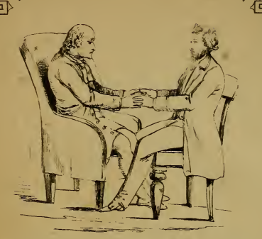
TRANSFUSION OF NERVO-VITAL POWER