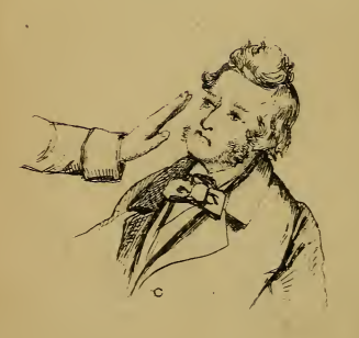
TOOTHACHE AND TIC.