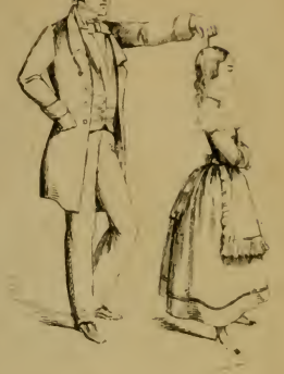
EXCITATION OF FIRMNESS.