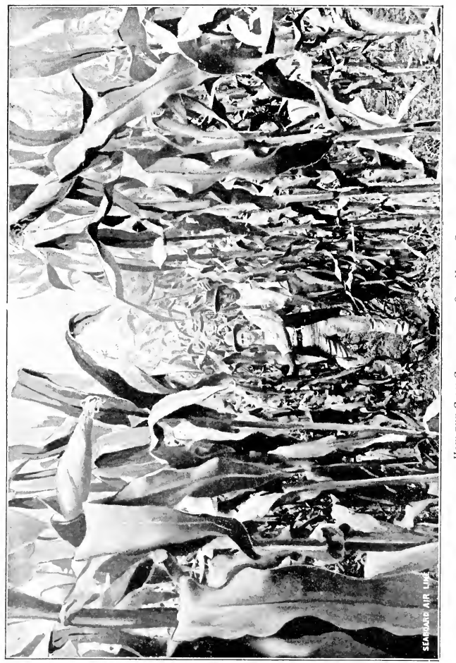
HOW THE CORN GROWS IN THE OLD NORTH STATE.