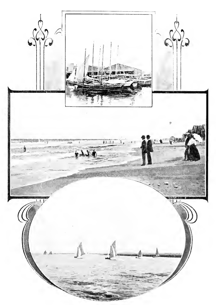
ON THE ATLANTIC BEACH, WILMINGTON.