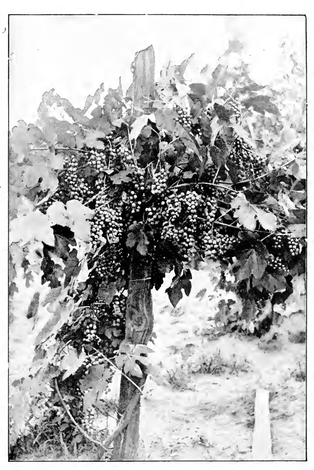
GRAPES GROW IN PROFUSION EVERYWHERE.