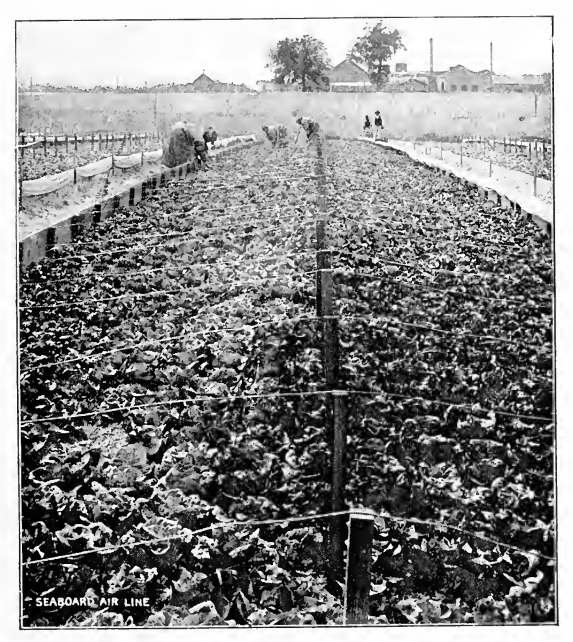
LETTUCE FOR EARLY MARKET, WILMINGTON TO FAYETTEVILLE.