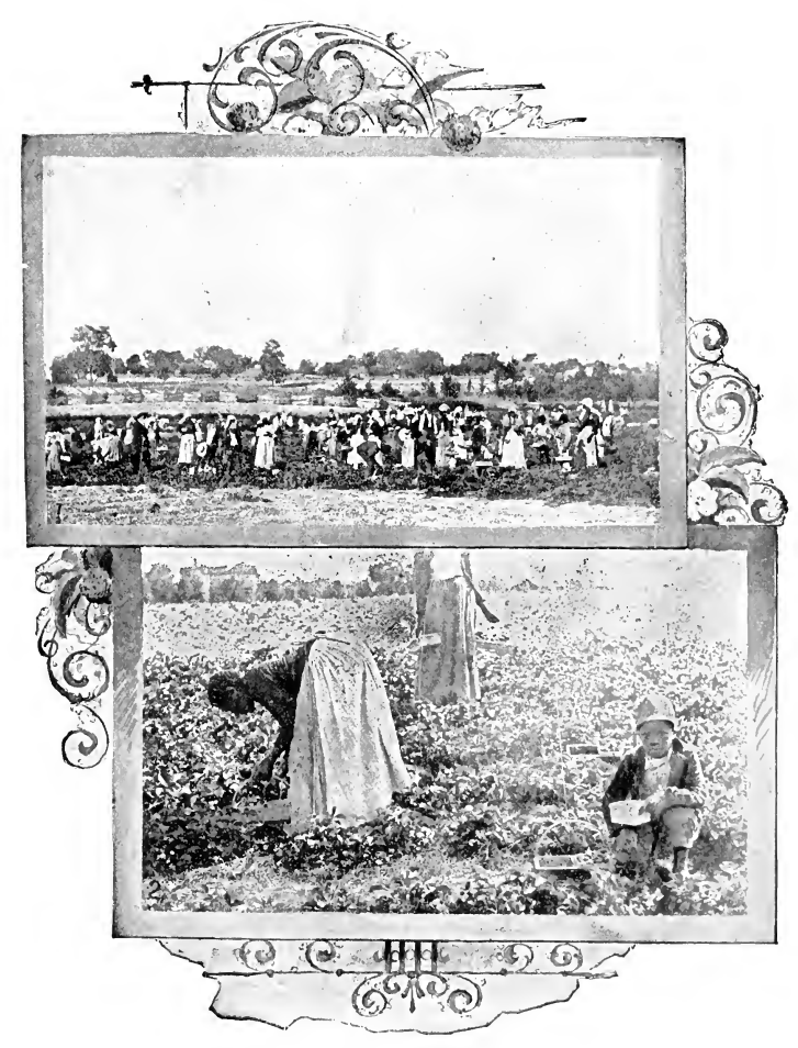
IN THE BERRY FIELDS.