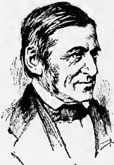
R. Waldo Emerson

posed of materials which he collected for purposes of lecturing. His astonishing lack of method is familiar; he would constantly make note of any idea which occurred to him; and when he wished to give a lecture, he would huddle together as many of his notes as should fill the assigned time. But though this bewildering lack of system for a moment disguised the true character of his essays,