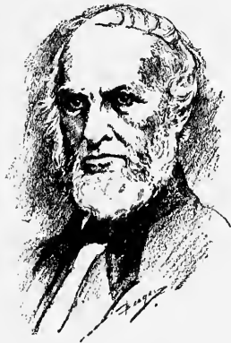
John G. Whittier

Though Whittier was precocious, and his literary career extended over more than sixty-five years, he was not prolific. He never wrote much at a time, and he never wrote anything long. In the seven volumes of his collected works there are very few pieces which might not have been produced at a single sitting. Again, his work throughout these sixty-five years was far from varied in character. The limited circumstances of his life combined with lack of humor to make his writings seem often commonplace. What gives them merit are occasional passages where