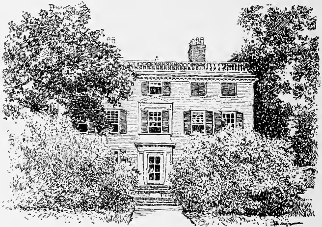
ELMWOOD, CAMBRIDGE, MASS., BIRTHPLACE OF JAMES RUSSELL LOWELL.

The fact that Lowell was constantly sensitive to incompatible impressions was not his only temperamental obstacle. The well-known circumstance that he was unable satisfactorily to revise his writing indicates how completely he was possessed by each of his various moods, which