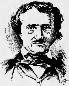
Edgar A. Poe.