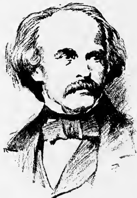
Nath l Hawthorne

and fifteen years older than Lowell. He died during the Civil War; and Emerson and Longfellow survived until 1882, Lowell till 1891, Whittier till 1892, and Holmes till 1894. Though Hawthorne, however, was the first to die of this little company, he had been a fellow-writer with them during the thirty years when the full literary career of all