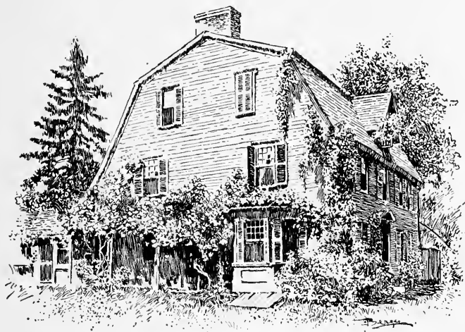
AN EARLY HOME OF HAWTHORNE, OLD MANSE, CONCORD.

prove what a wealth of imaginative impulse he never coined into finished literary form. They reveal, too, another characteristic fact. Though Hawthorne wrote hardly any verse, he was a genuine poet. His only vehicle of expression was language, and to him language meant not