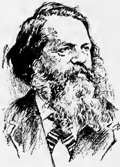
James T. Fields

little slow to make literature for ourselves. It is not that we lacked it, of course. The names we have already considered belong not only to the history of those various phases of the Renaissance with which we have chosen to consider them, but to that of letters, too. Hardly one of these men, however, was primarily literary. All deserve distinction in literary history chiefly because they did with loving care the writing which they held their earthly business.