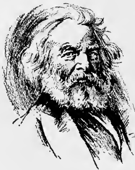
Henry W. Longfellow

in 1819; Emerson's sermon on the Lord's Supper, which marks the beginning of transcendental disintegration, was not preached until 1832. Longfellow's youth, in brief, came just when the religious and philosophic buoyancy of the New England Renaissance was surging; and this affected him all the more because in a region and at a