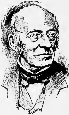
Wm. Lloyd Garrison.

To Channing the conclusion here stated was unavoidable. If human beings are essentially good, they have a natural right to free development. No form of environment could more impede such development than lifelong slavery. So slavery confronted honest believers in human