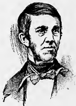
Oliver Wendell Holmes.

Dr. Holmes's maternal grandfather was a judge and a Fellow of Harvard College. Thus hereditarily allied with