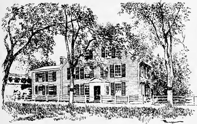
HOLMES'S BIRTHPLACE, CAMBRIDGE.

Though throughout Holmes's fifty years of Boston residence he was a man of local eminence, his eminence was