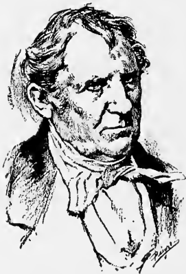
J Fenimore Cooper

published anything; he died at the age of sixty-two having written some ninety volumes. Of these hastily written works a number dealt with matters of fact; for one thing, with characteristic asperity and lack of tact, he published various comments on both America and England, in which he seemed chiefly animated by a desire to emphasize those truths which would be least welcome to