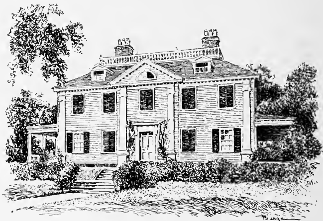
LONGFELLOW'S HOME, CRAIGIE HOUSE, CAMBRIDGE.

he laid his professorship down, there were hundreds who knew him as a poet for every one who knew that he was a teacher. In point of fact, too, the work which he did during the twenty-seven years of his purely literary life hardly extended, although it certainly maintained, the poetical