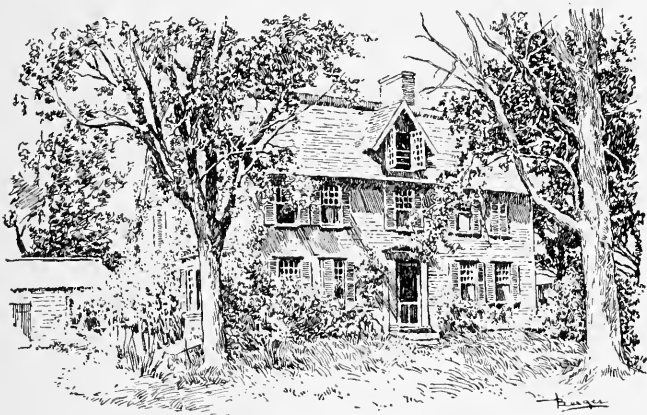
WAYSIDE, CONCORD, HOME OF NATHANIEL HAWTHORNE.

Greece, and under the term "romantic" that which most nearly approached realization in the art and the literature of mediæval Europe. The essence of classic art is perhaps that the artist realizes the limits of his conception, and within those limits endeavors to make his expression com-