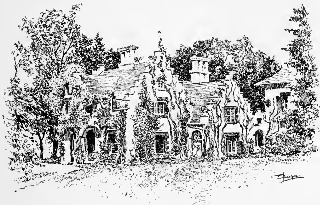
SUNNYSIDE, IRVING'S HOME AT TARRYTOWN

Origin and Purpose of the Knickerbocker History.