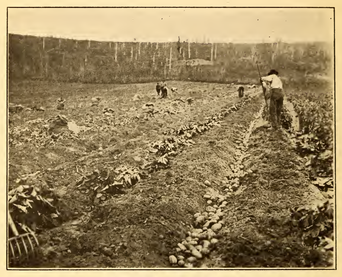
FIGURE 1.—Digging potatoes near Fairbanks

When level culture is practiced, the ground should be harrowed soon after planting is done and again after the plants begin to emerge. The field should be cultivated two or three times during the season, the number of times depending upon the presence of weeds. On comparatively level land the rows should be ridged when the plants are about 6 inches high and again just before they