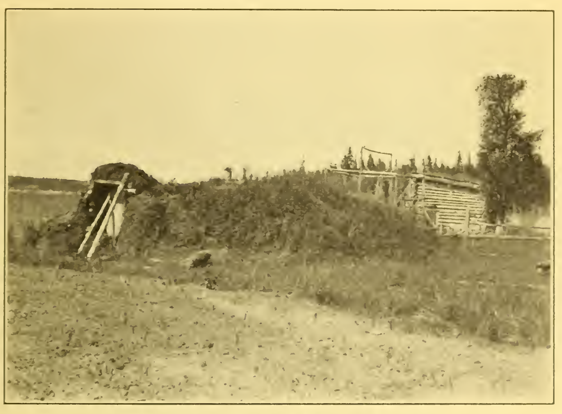
FIGURE 2 .--- A farmer's potato cellar

The average yields per acre obtained annually at the Fairbanks station were 126 bushels in 1910, 228 bushels in 1911, 235 bushels in 1912, 100 bushels in 1913, 150 bushels in 1914, 171 bushels in 1915, 133 bushels in 1917, 51 bushels in 1918, 75 bushels in 1921, 137 bushels in 1927, 85 bushels in 1928, and 204 bushels in 1929. For the last