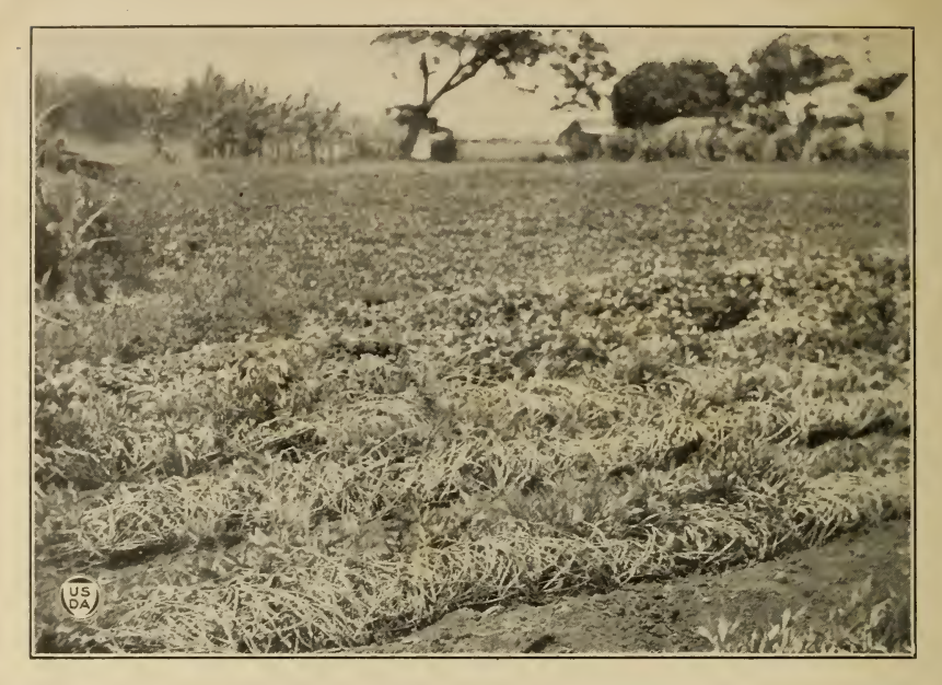
FIG. 1.-VINES TURNED TO ONE SIDE TO PROMOTE EVAPORATION FROM SOIL OF EXCESSIVE MOISTURE CAUSED BY STANDING WATER.