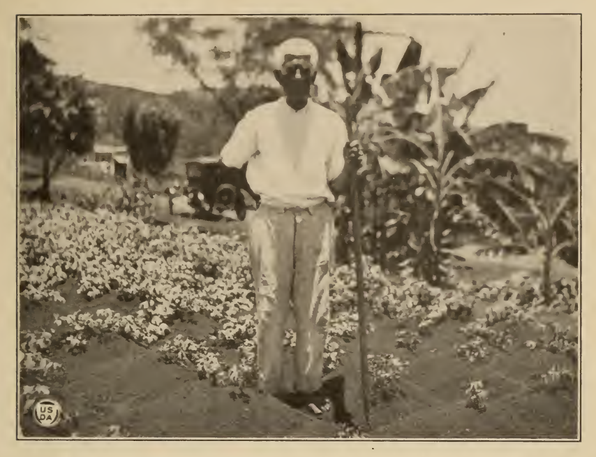
FIG. I.-SWEET POTATOES GROWN BY MOUND OR HILL METHOD.