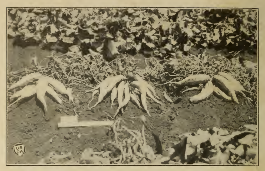
FIG. I.-HILLS BEARING SWEET POTATOES IN GOOD CLUSTERS. CUTTINGS SHOULD BE MADE FROM PLANTS OF THIS TYPE.