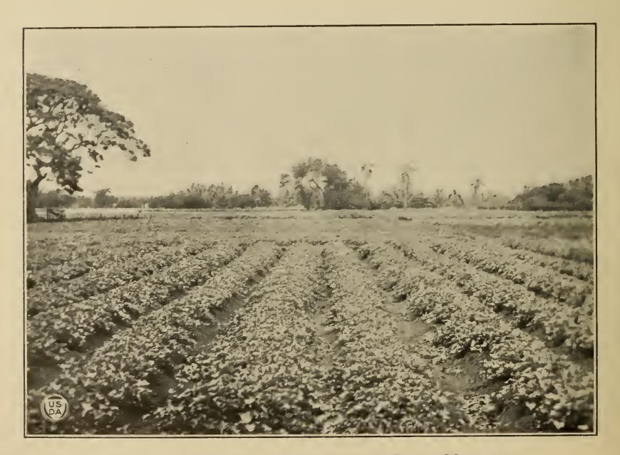
FIG. 2.-SWEET POTATOES GROWN BY RIDGE METHOD.

FIG. 1.-VINES TURNED TO ONE SIDE TO PROMOTE EVAPORATION FROM SOIL OF EXCESSIVE MOISTURE CAUSED BY STANDING WATER.