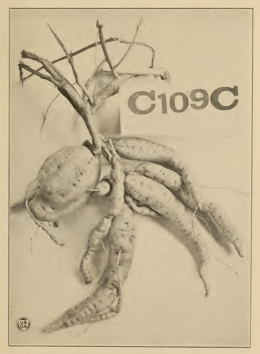
SWEET POTATOES PRODUCED IN HEAVY CLAY SOIL. IRREGULAR IN SHAPE AND UNMARKETABLE.