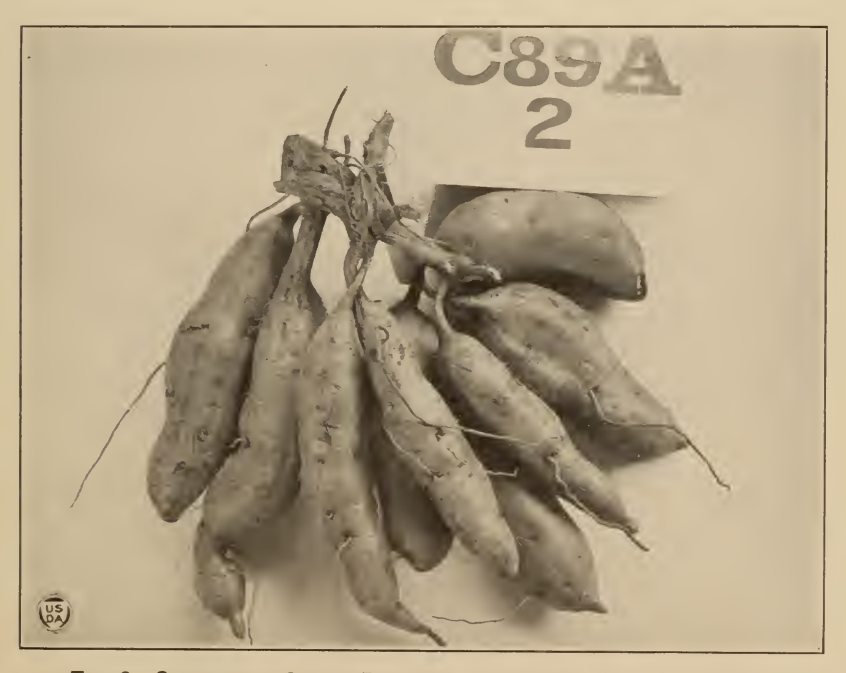
FIG. 2.-CLUSTER OF SWEET POTATOES OF UNIFORM SIZE AND SHAPE.