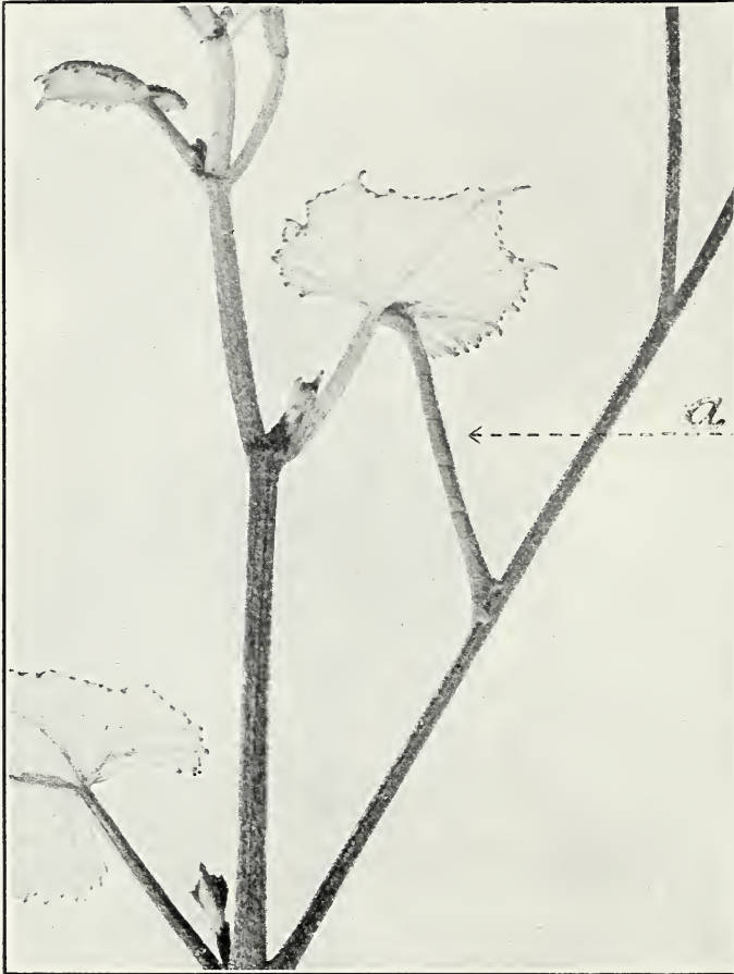
LARVA OF THE GRAPEVINE LOOPER.