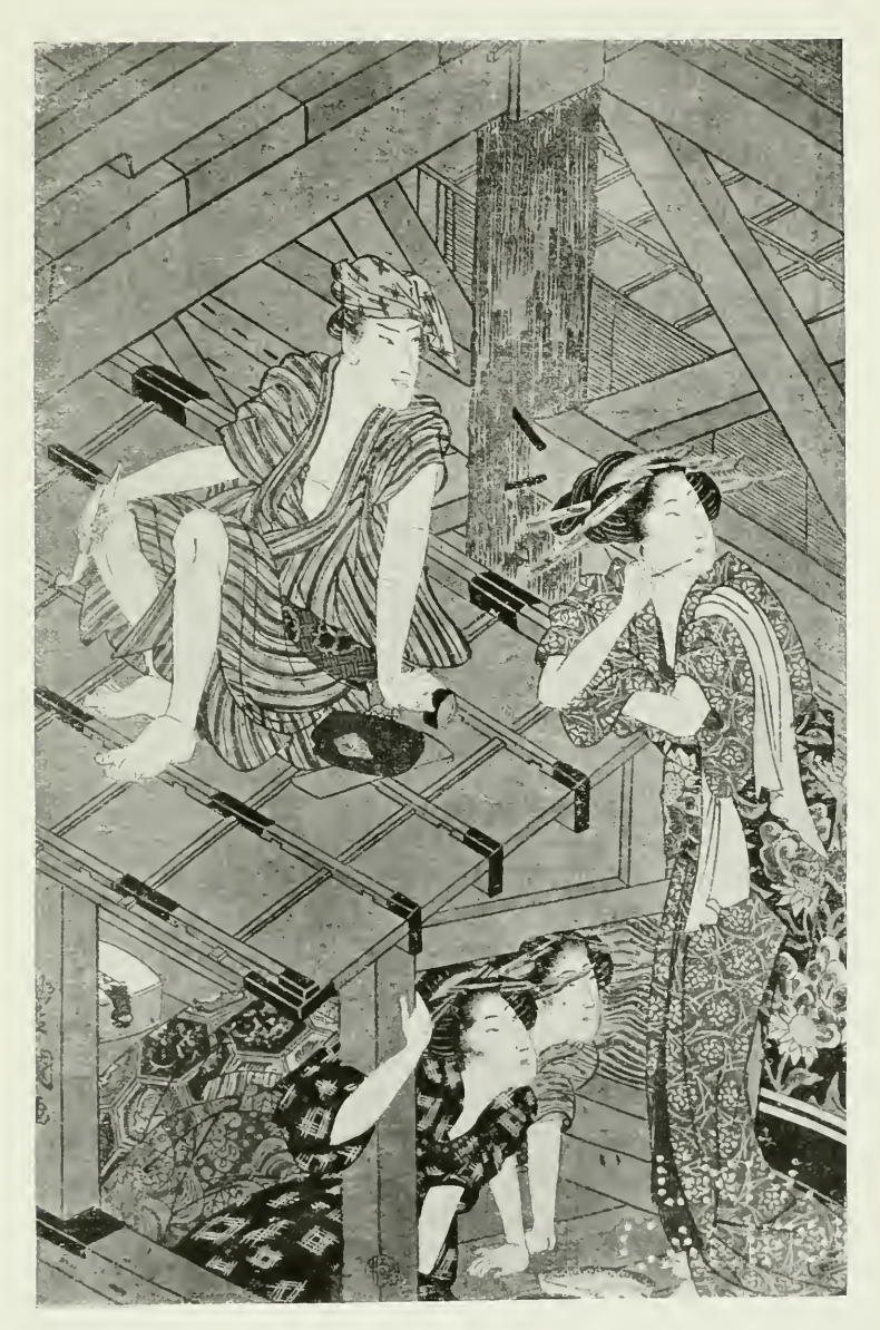
Watching the Fireworks from Ryogōku Bridge, E. 4900-86.