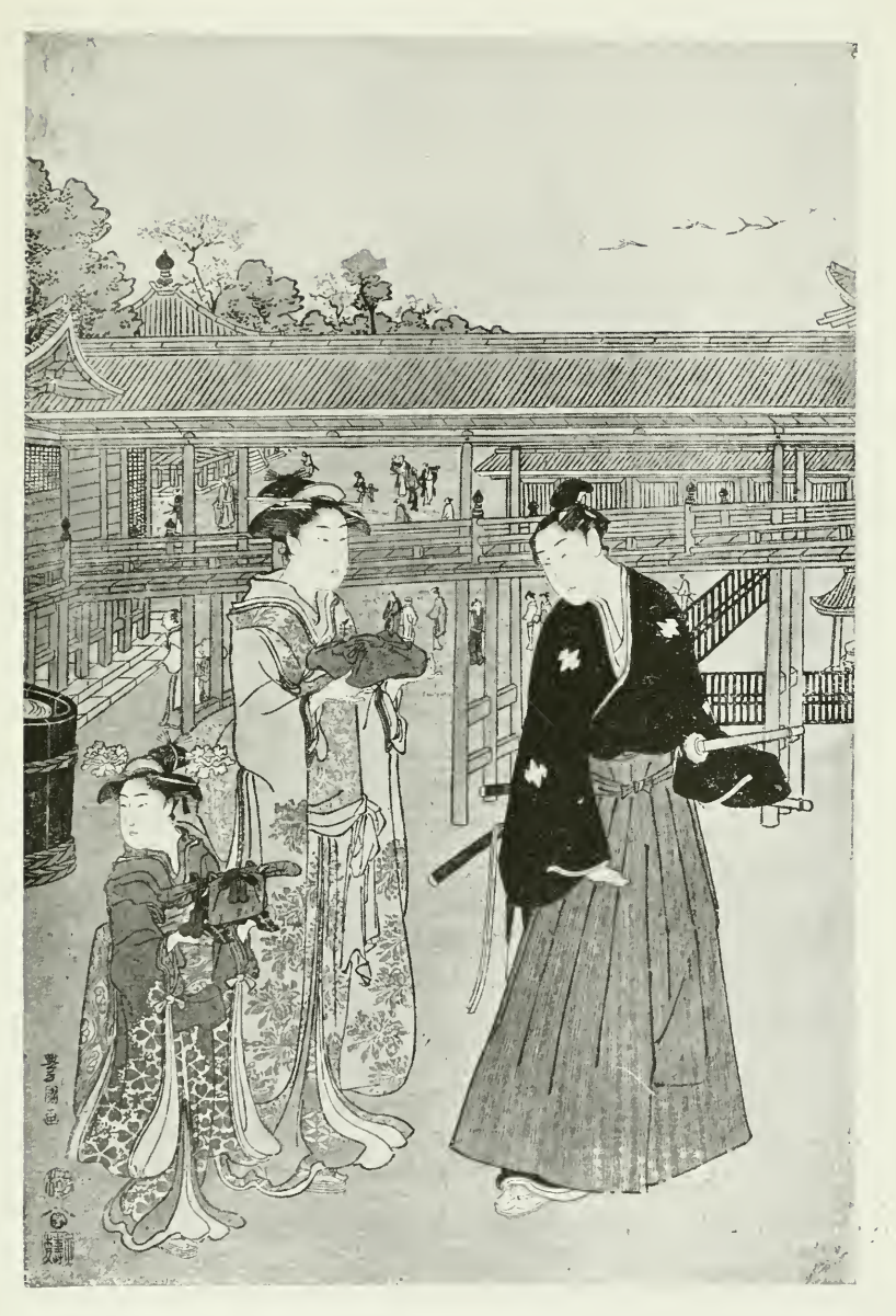
A Noble Youth, with female attendants, visiting a temple. E. 4222-'97.