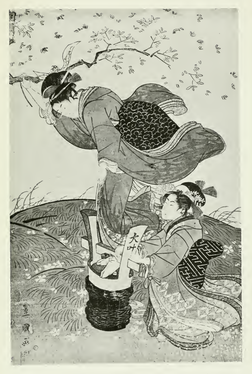
A Young Lady binding her poem to the branch of a cherry-tree. E. 1431-'98.