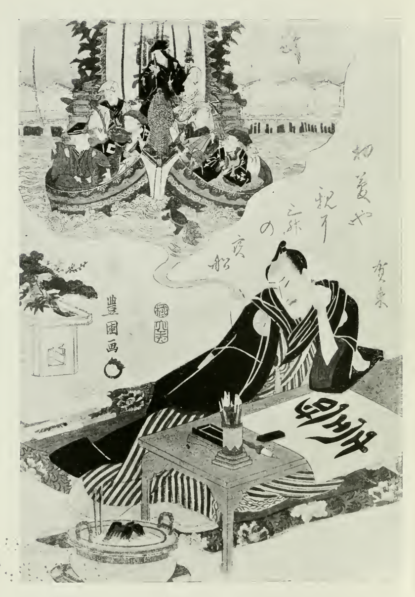
The First Dream in the New Year of an Ukiyoye painter. The Ship of Good Fortune. (Perhaps a portrait of the artist.) E. 4903-'86. Frontispiece.]