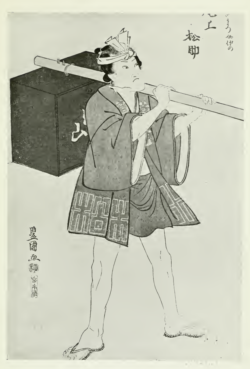
Onoye Matsusuke as a porter. 21360.