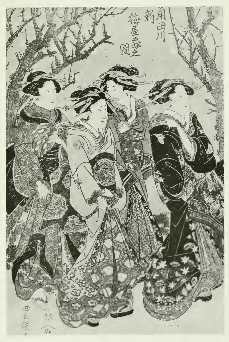
PICNIC OF WOMEN on the Banks of the Sumida River. 21356.