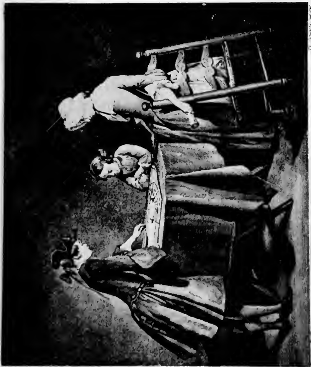
LE JEU DE L'ŒUF.