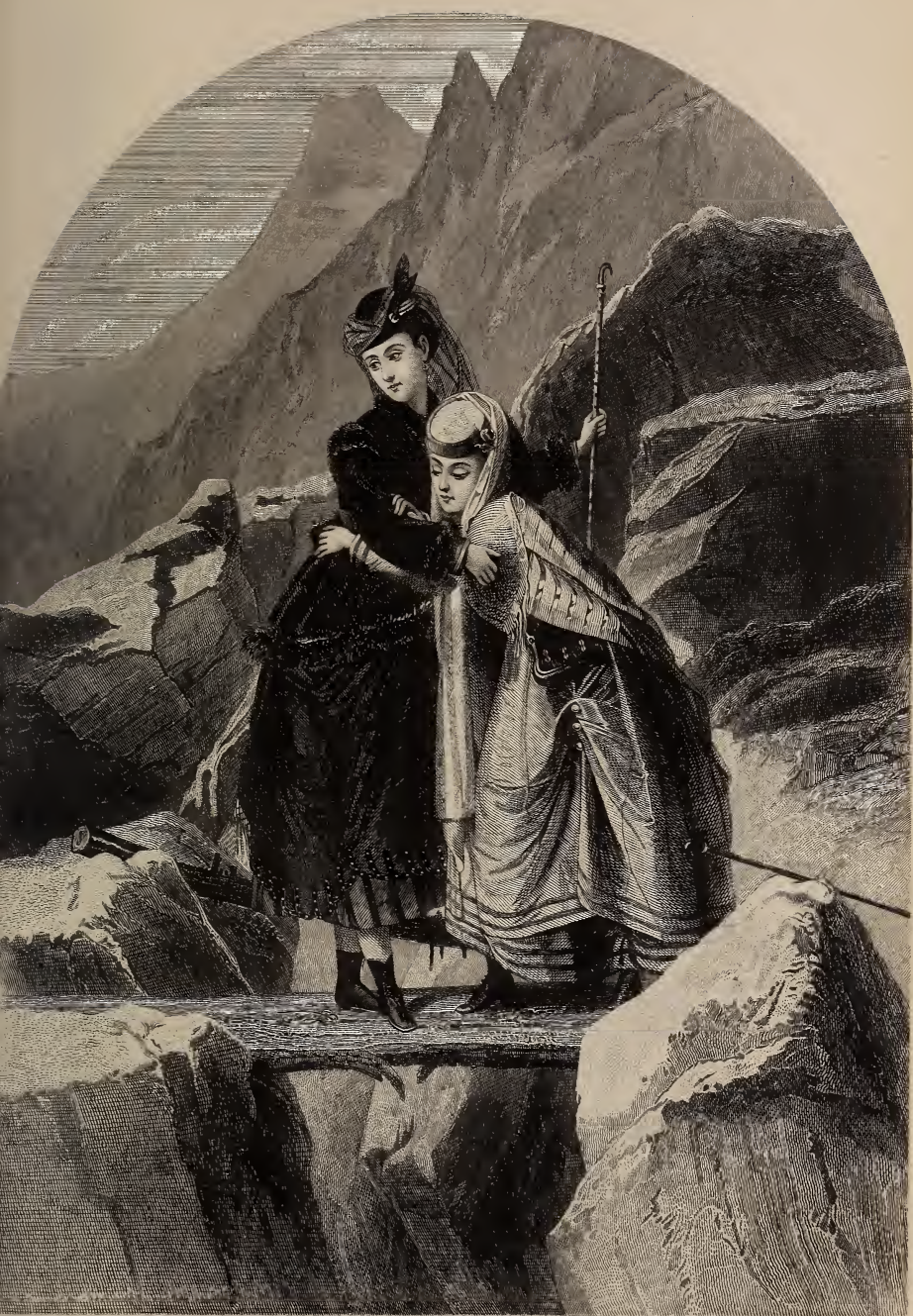
ALPINE TOURISTS—THE RAVINE.