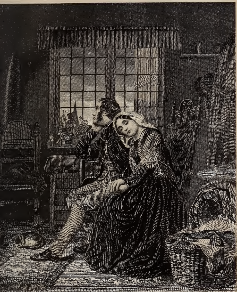
THE EMPTY CRADLE.