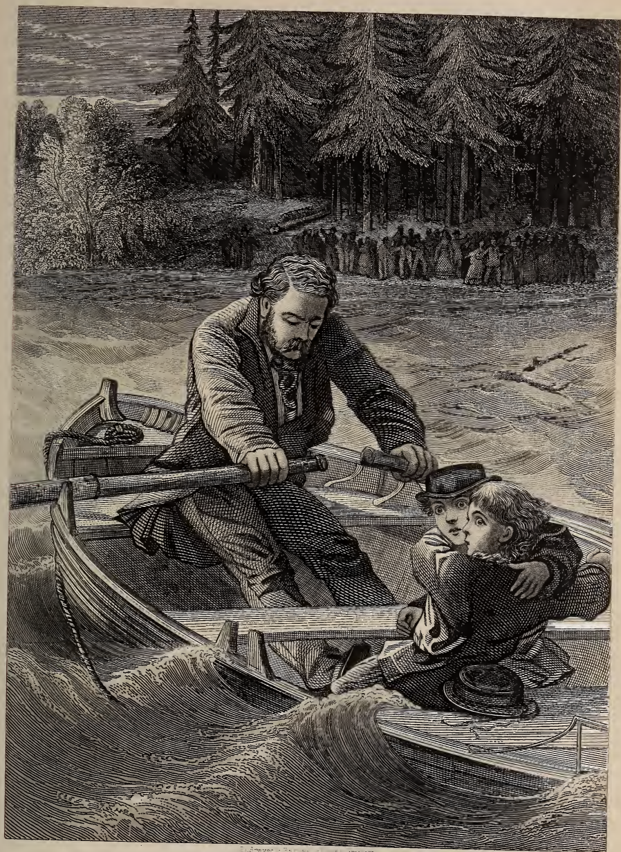
DRIFTING INTO DANGER.