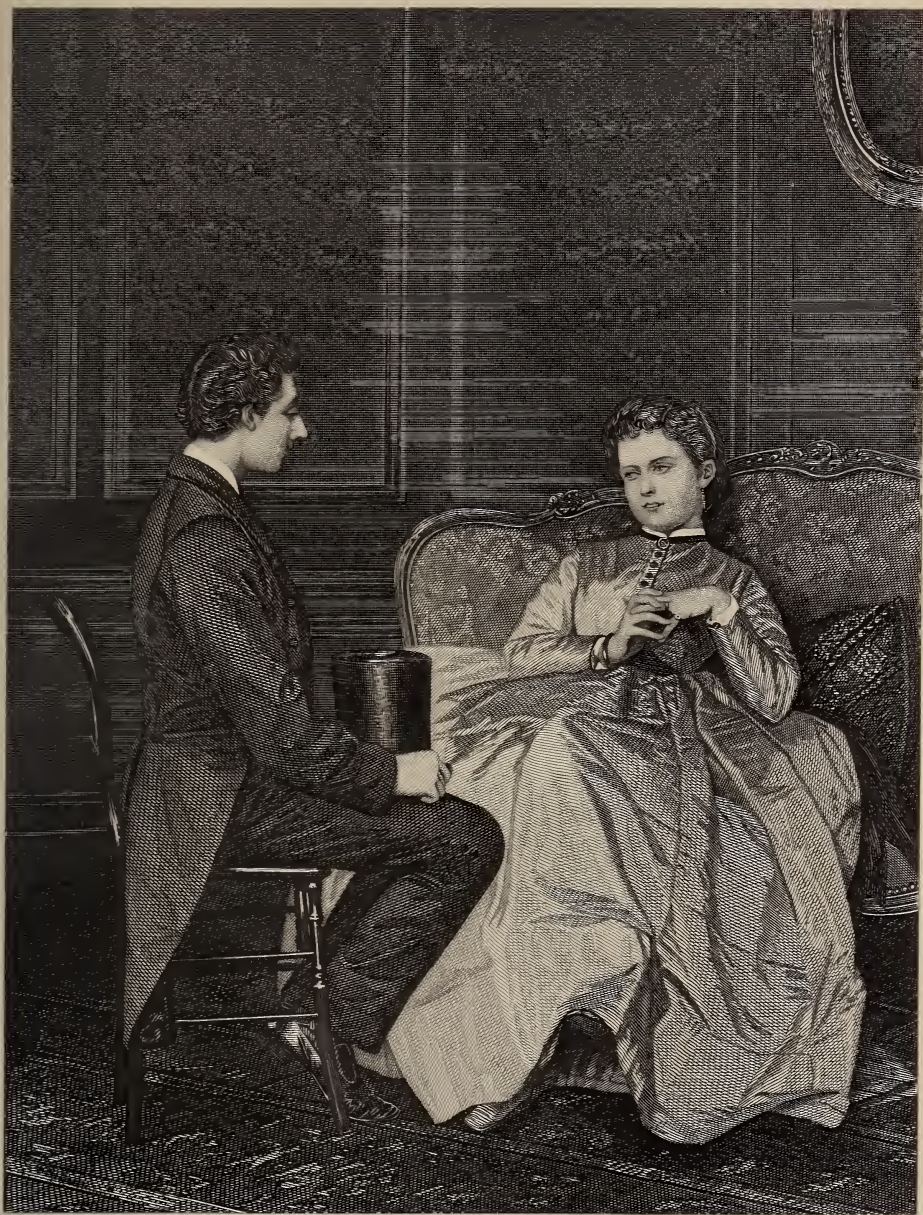
THE BASEFUL WIDOW