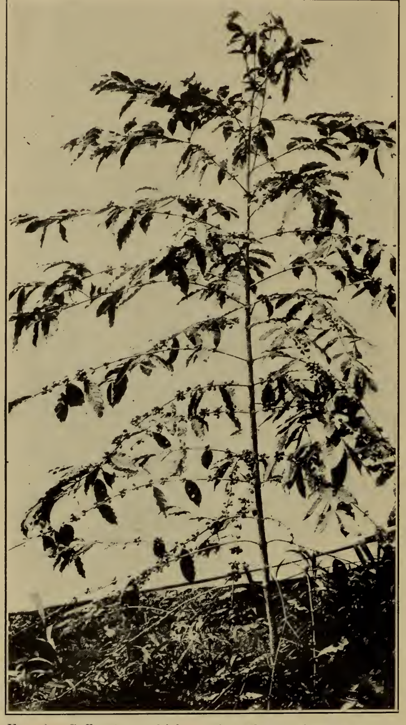
FIG. 2.—Coffee tree which carried 42 branches and more than 1,500 cherries. Photographed in September, 1910, prior to pruning

of every kind being allowed to develop freely. In the second row in contrast to the first, all uprights or suckers developing along the main stem were removed, thus holding the growth to the single original stem or trunk and developments from its laterals.