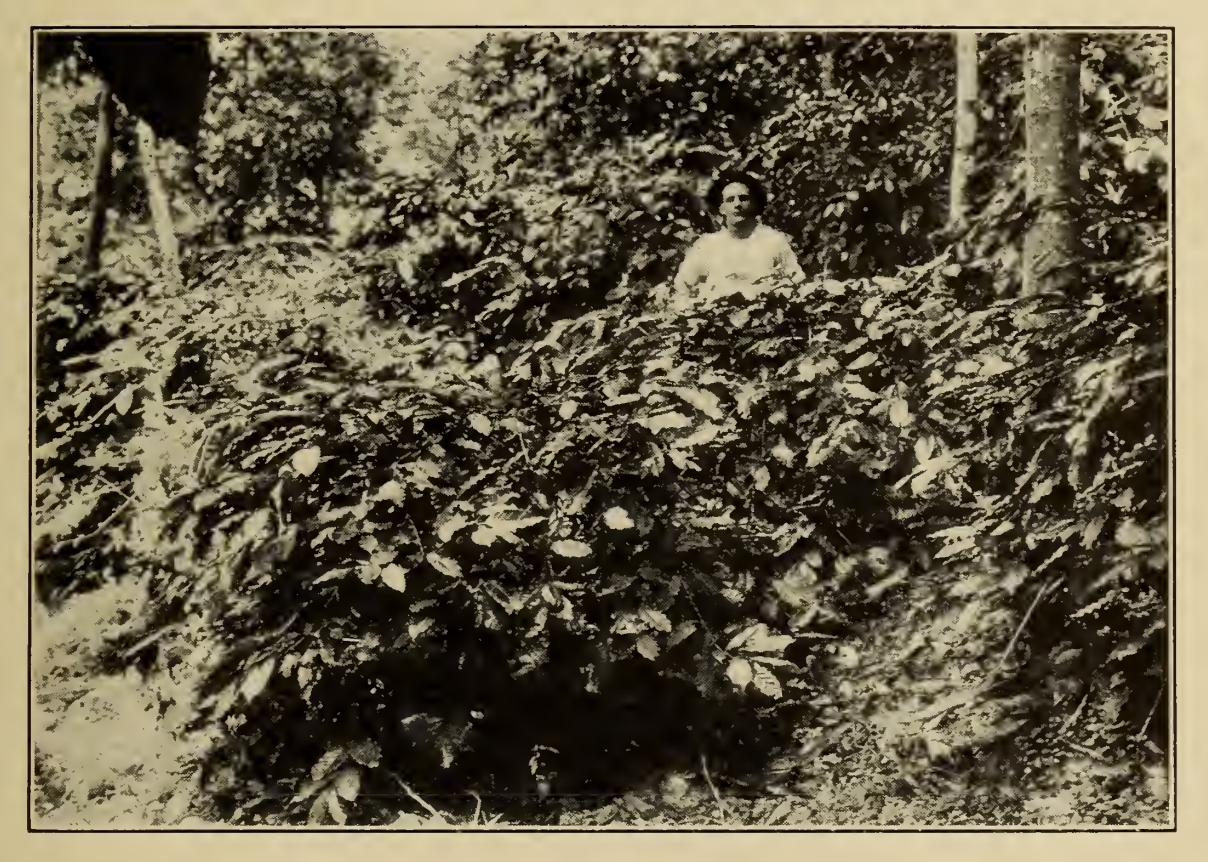
FIG. 4.—Foreground, trees topped at 4 feet December, 1910, and photographed September, 1914

The record of production for the seven following years showed the depressing effect of heavy pruning to be cumulative. For this period the trees which were held to a single trunk and those topped at 6 feet produced only two-thirds as much as the unpruned trees, whereas those that were topped at 4 feet produced slightly less than half as