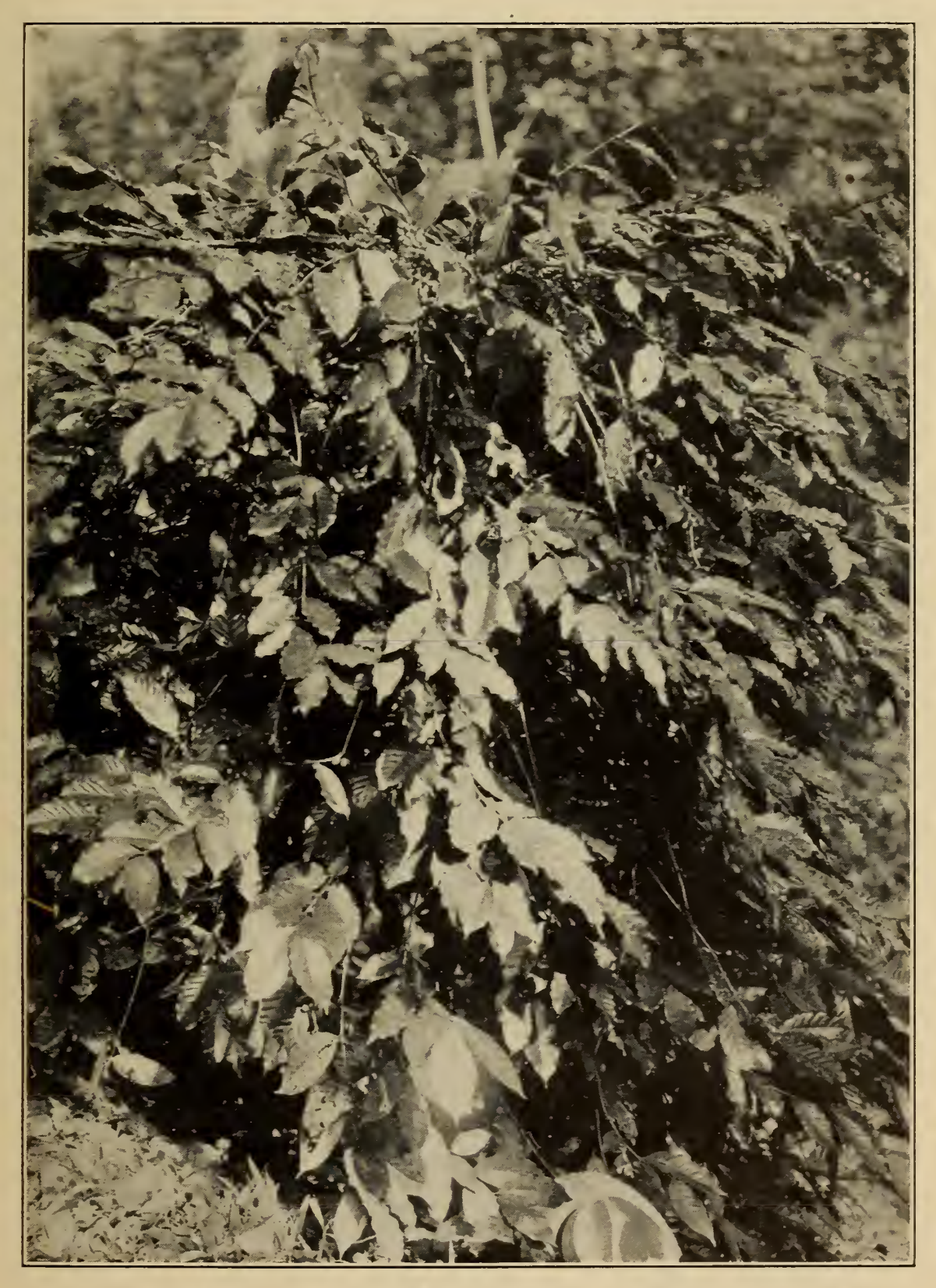
FIG. 3.—Topped at 6 feet December, 1910, and photographed August, 1914

The yield of the trees was recorded over a 10-year period. 1912– 1921, the first record being taken at a little less than two years after the first pruning. The depressing effect on production exercised by severe pruning or topping was less evident in the early years of the test than later. In the three-year period, 1912–1914, both the trees