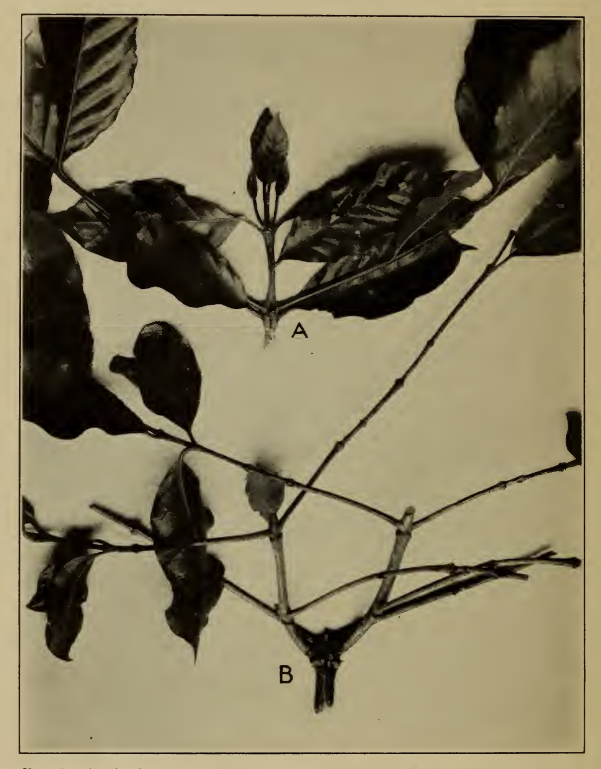
F1G. 1.—A, simultaneous development of the primary lateral branches and the upright stem; B, position of new uprights, developed from buds immediately below the primary laterals

(Fig. 1.) Thereafter a pair of laterals will develop in like manner at the base of most new internodes of the upright stem as this continues growth, but occasionally one or more internodes may be skipped or a single lateral may develop instead of a pair. If a primary