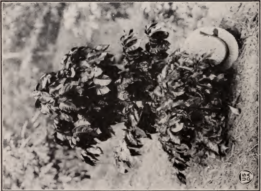
FIG. 1.—SAN RAMÓN COFFEE AT A LITTLE LESS THAN 3 YEARS FROM SEED.