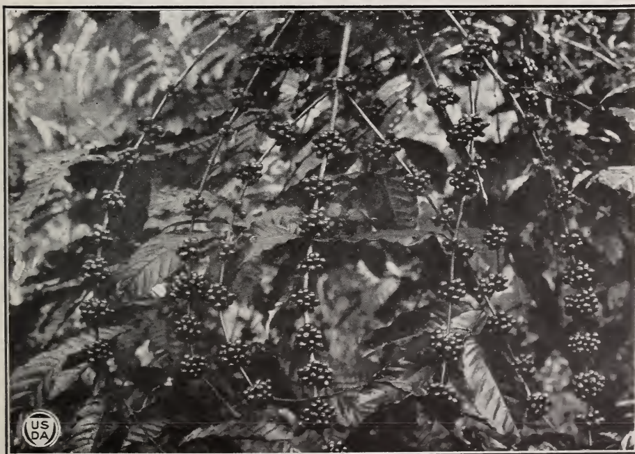
FIG. 2.— COFFEA ROBUSTA IN FRUIT.