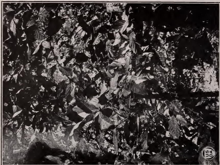
FIG. 2.—COFFEA DEWEVREI; TREE NO. 104 AT 5 YEARS FROM SEED.