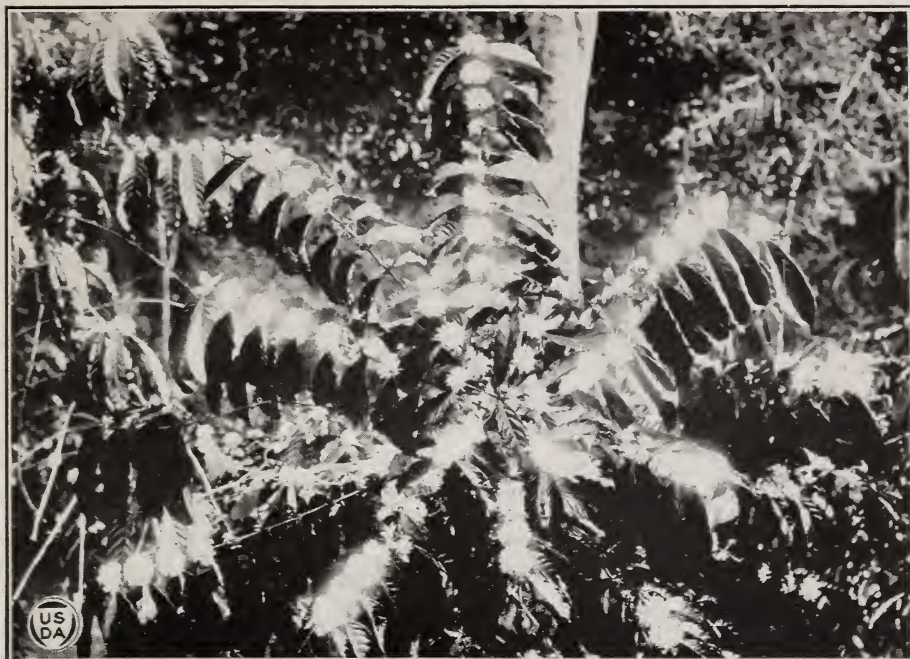
FIG. 1.— COFFEA QUILLOU IN BLOSSOM, FROM ABOVE.