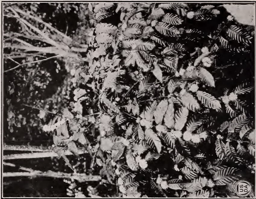
FIG. 2.— COFFEA ROBUSTA IN BLOSSOM.