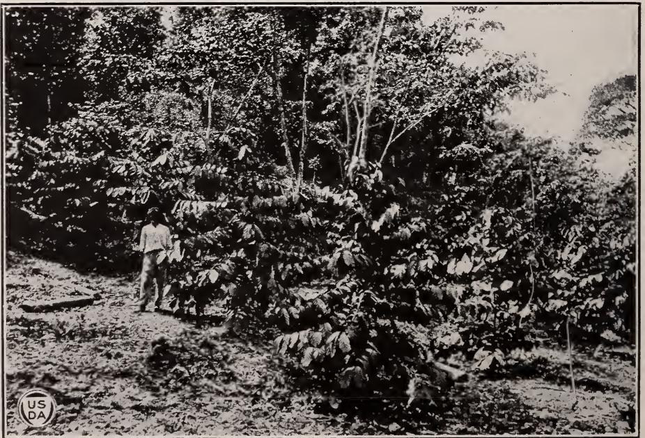
FIG. 2.— COFFEA ROBUSTA AT 3½ YEARS FROM PLANTING SEED.