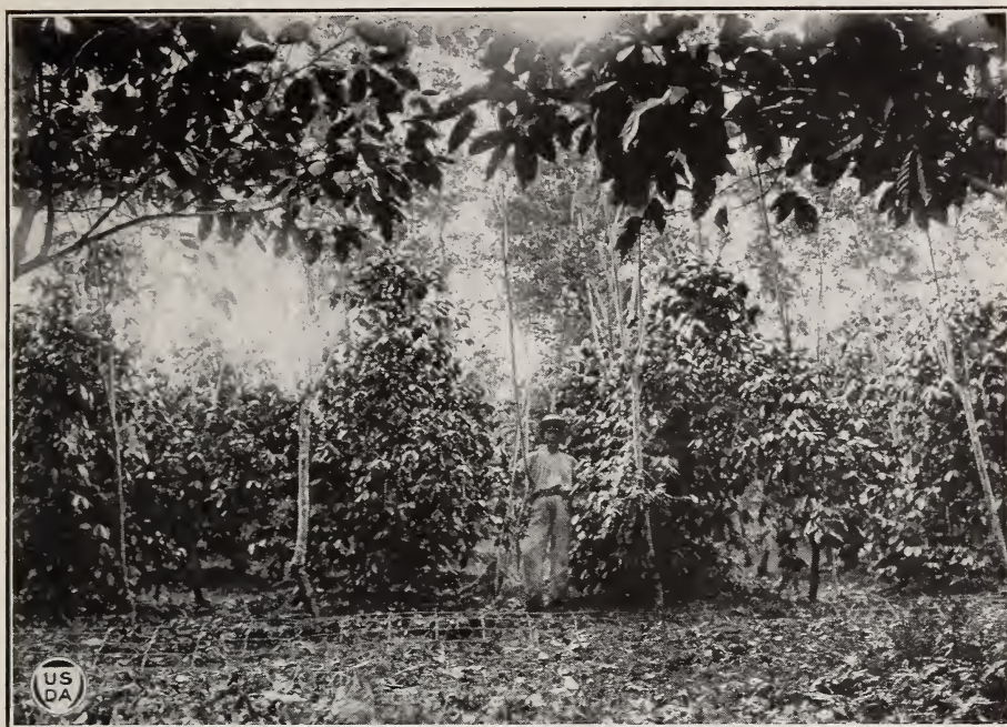
FIG. 1.—BOURBON COFFEE.