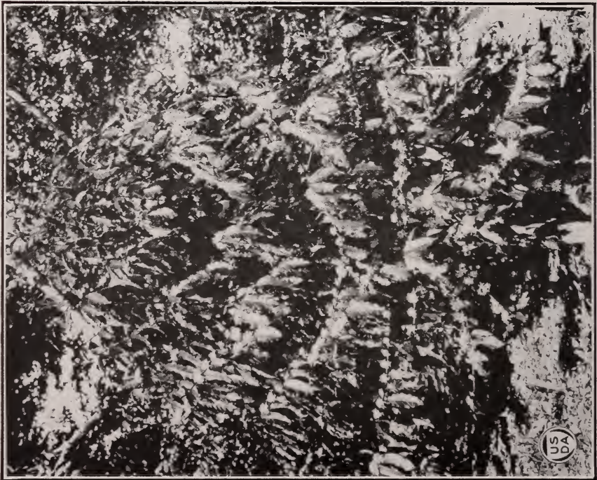
FIG. 1.—PADANG COFFEE, YOUNG GROWTH.