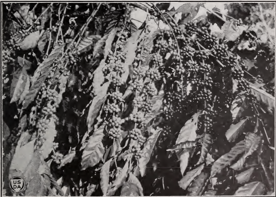
FIG. 2.— COFFEA CONGENSIS HYBRID IN FIRST PLANTING.