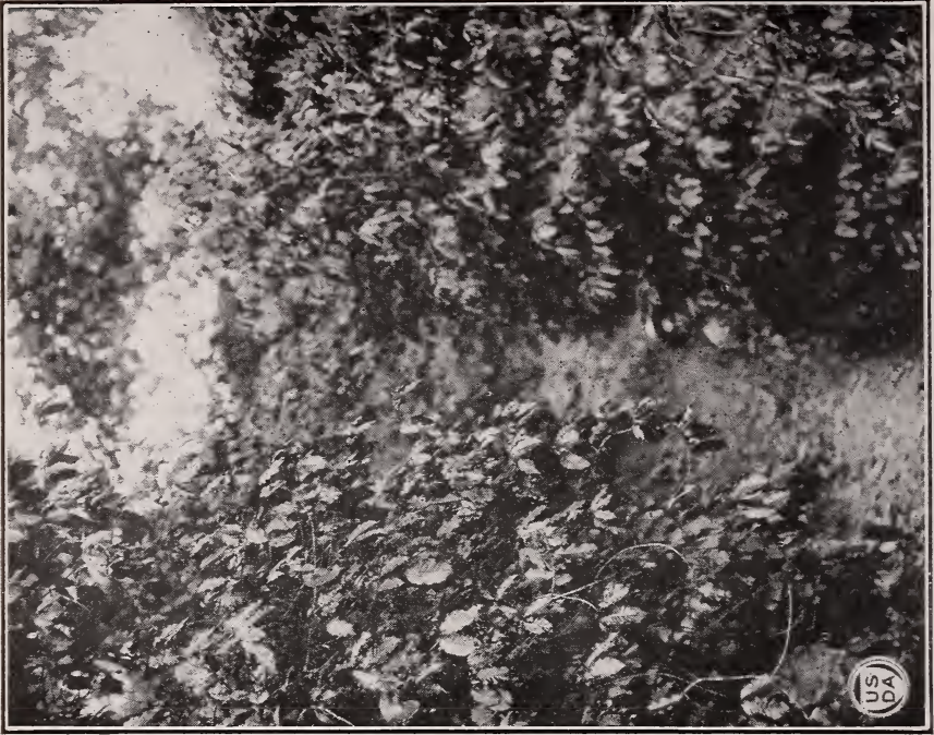
FIG. 2.—ERECTA COFFEE.