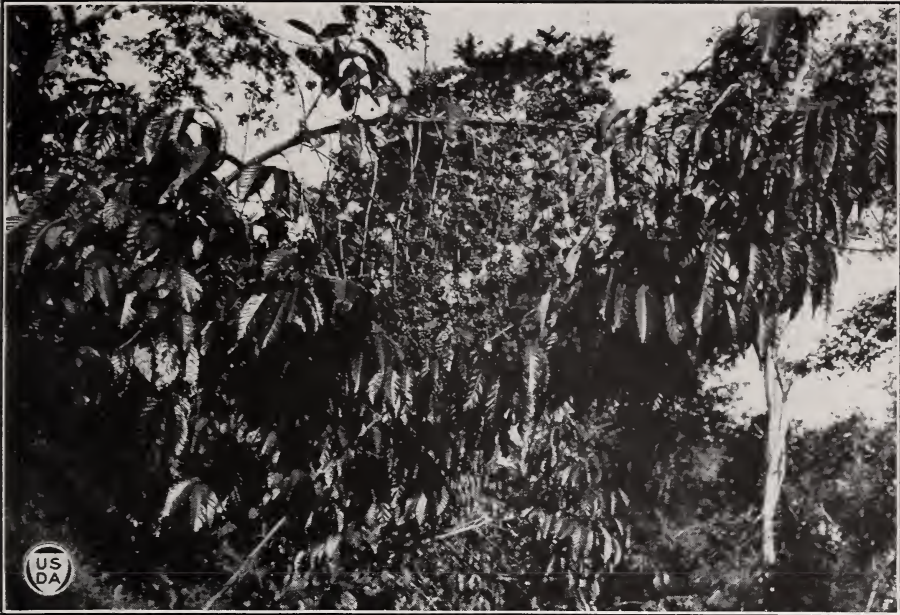
FIG. 1.— COFFEA CANEPHORA BENT WITH HEAVY CROP.