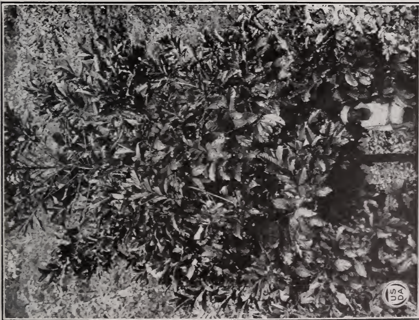
FIG. 1.—COFFEA DEWEVREI; TREE No. 1007, AFTER 8 LITERS OF CHERRIES HAD JUST BEEN PICKED FROM IT.