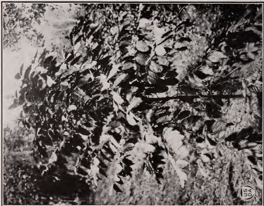
FIG. 1.— COFFEA LAURENTII (S. P. I. No. 28080) AT A LITTLE OVER 4 YEARS FROM SETTING.