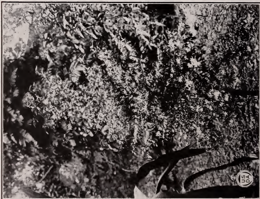
FIG. 1.—MATURE TREE OF MURTA COFFEE IN BLOSSOM.