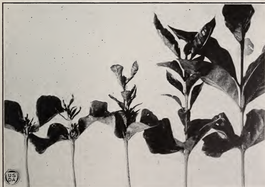
FIG. 2.—HETEROGENEOUS FORMS FOUND IN SEEDLINGS OF MURTA COFFEE.