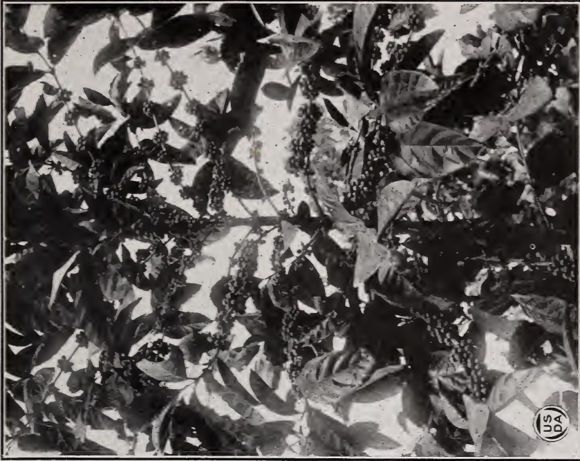
FIG. 2.—COFFEA EXCELSA WITH FRUIT.