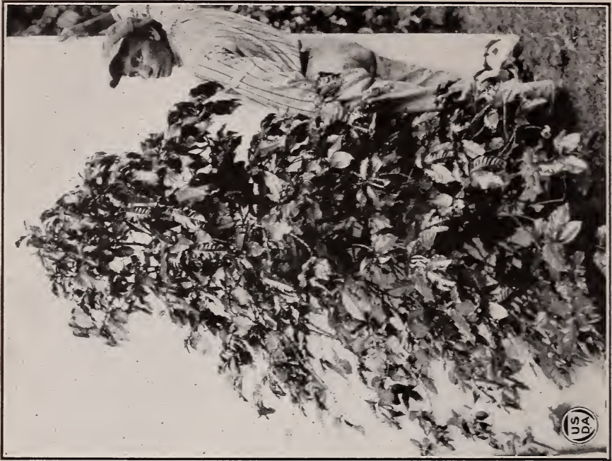
FIG. 2.—A 9-YEAR-OLD TREE OF SAN RAMÓN COFFEE.