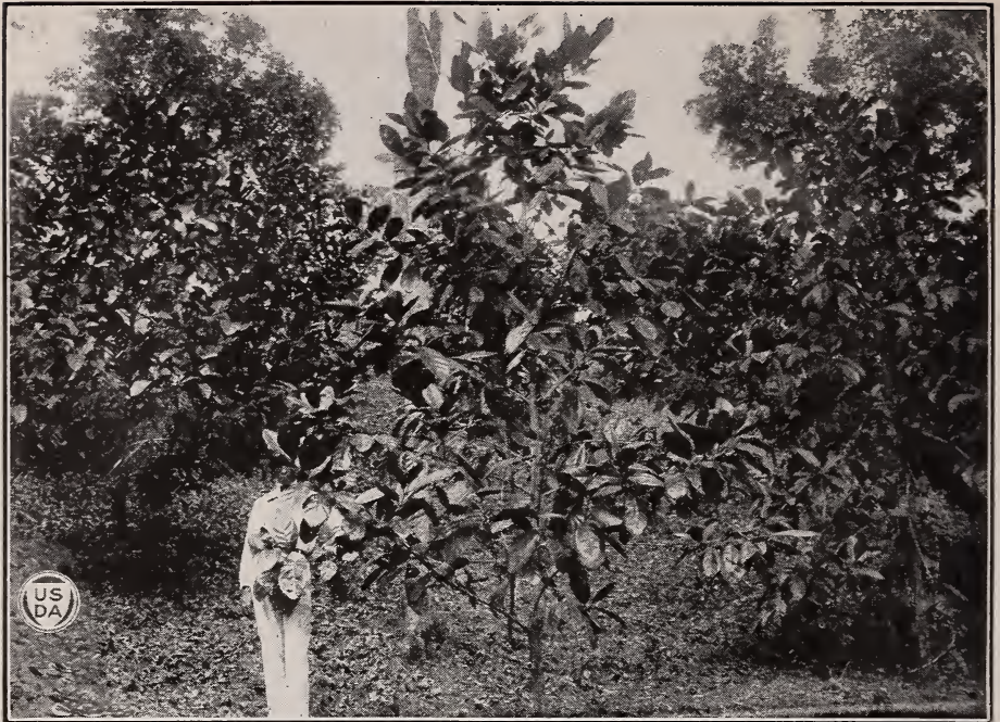
FIG. 1.— COFFEA EXCELSA AT A LITTLE MORE THAN 6 YEARS FROM PLANTING SEED.