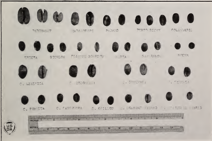
FIG. 2.—COFFEE BEANS.