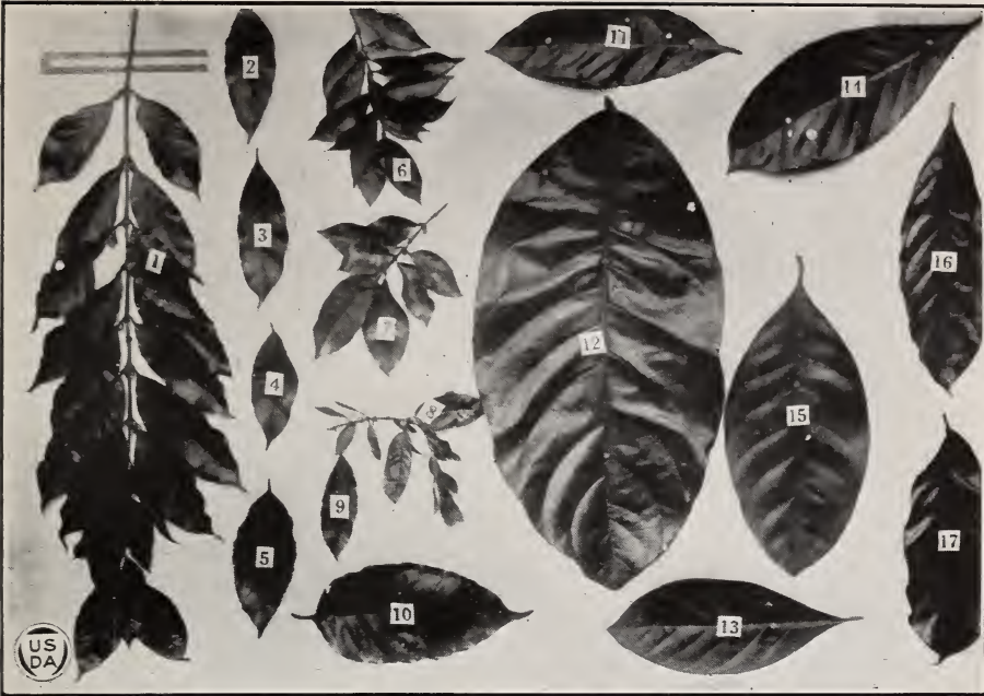
FIG. 1.—COFFEE FOLIAGE: 1, PORTO RICAN; 2, PADANG; 3, COLUMNARIS; 4, ERECTA; 5, BOURBON; 6, POINTED BOURBON; 7, SAN RAMÓN; 8, MURTA; 9, MOCHA; 10, MARAGOGIPE; 11, C. QUILLOU ; 12, C. DYBOWSKII ; 13, C. LIBERICA ; 14, C. DEWEVREI ; 15, C. EXCELSA ; 16, C. CANEPHORA ; 17, C. ROBUSTA .