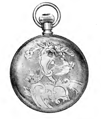
28 Gent's Hunting Case Watch

Twenty year gold filled case, fitted with genuiue seven jeweled Waltham movement.