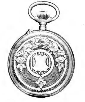
Gent's Solid Silver Watch

Open face, white enameled dial, snap case, handsomely engraved, stem wind and set, antique bow, cylinder movement. We warrant this case solid silver, 800-1000 fine. Retail dealers are asking $5.00 for same watches.