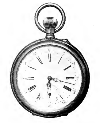
Gents' Open Face Polished Nickel Watch