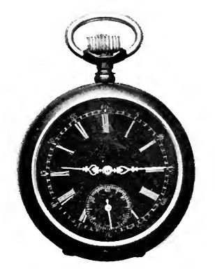
6 Gent's Gun Metal Watch

Black enameled dial, silver hands and second hand, silver bow and crown, polished steel case, open face, heavy beveled crystal. This is an entirely new style of watch and is having a very heavy sale.