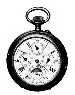
17 Gent's Calendar Watch

Case of gun metal with gold finished bow and crown, fancy gilt hands, porcelain dial. This watch gives the day of the week, day of the month and moon phases. Lever jeweled movement with jointed back. Splendid value at our wholesale price.