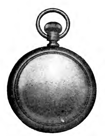
32 Gent's Open Face Watch

Solid silveroid case, that looks and wears like solid silver. A watch that not one person in a hundred would think could be sold for less than $10.00.