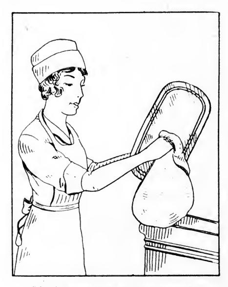
Fig. 5. Blanching with cheese-cloth.