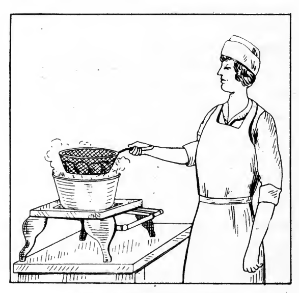
Fig. 3. Blanching with wire basket.