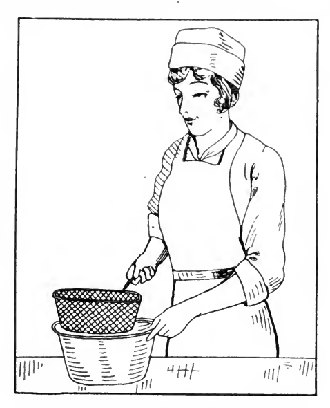
Fig. 4. After being blanched the product is immediately dipped in cold water.