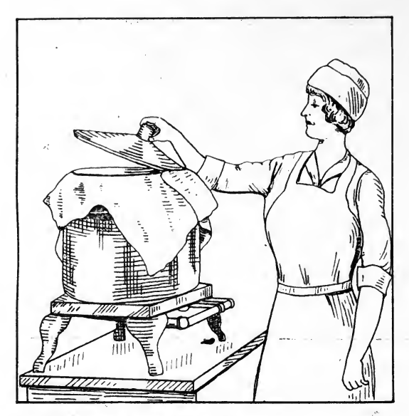
Fig. 2. Adjustment of ordinary cover with cloth gives a tight fit and boiler will hold the steam.