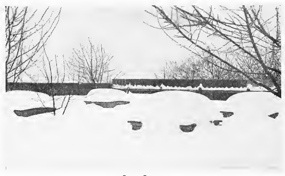
Snow Scene Snow acts as a blanket and protects the bees from severe weather.