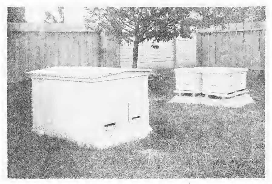
Illustration showing group of four colonies on permanent stand before packing, also quadruple case packed.