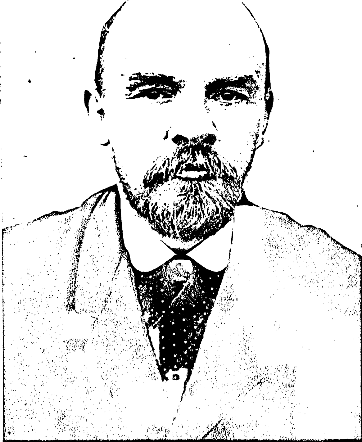
V. I. LENIN 1914