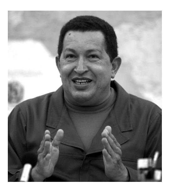
Figure 1.1 Hugo Chávez

Hugo Chávez's victory in the Venezuelan presidential election in December 1998, coincided with these events. His inaugural address two months later was a sign of things to come, and testimony to how different he was from all previous occupants of the post. He denounced the national constitution and proposed the immediate election of a Constituent Assembly to draw up a new constitution that acknowledged the rights of all Venezuelans and undertook to use the nation's resources for the benefit of the majority rather than the profit of a few. Although he came from a military background, his language and manner expressed clearly how closely he identified with both the vision and the spirit of the emerging anti-globalisation movement (it is significant that in Spanish the movement is called altermundista , a movement for another world).