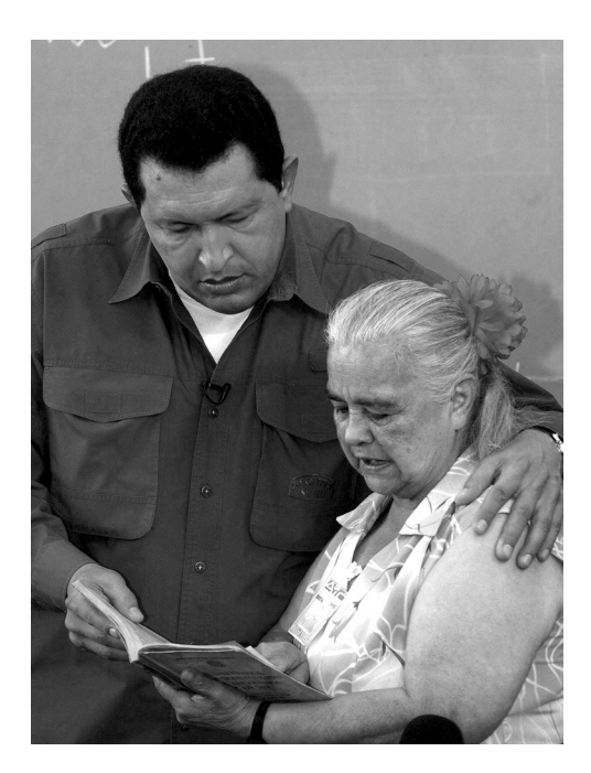
Figure 6.1 Chávez during the literacy campaign – the Misión Robinson

a response to their demands. Perhaps this was the embryo of a participatory democracy that went far beyond representation to direct control? That was the tantalising possibility, and there was certainly a sense of vigorous and committed involvement as the Missions got under way. The state institutions were still largely dominated by the old functionaries and there was a mounting anger at what was seen as a combination of sabotage (a general go-slow) and the continuing corruption of the system. The leadership of the Missions were a new layer, generally younger and from poorer backgrounds; many were sent to Cuba for training courses, practical and ideological. The problem was that the two systems worked in parallel but not in any coordinated way – in fact, as the health sector showed, they would often compete. But in neither area was there any sense of strategic planning. It was perhaps in housing where this was