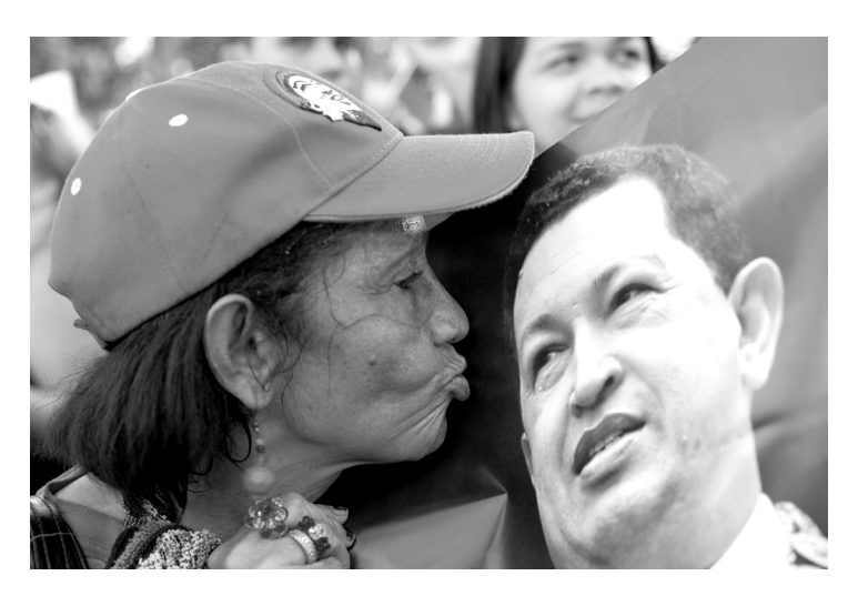
Figure 8.1 Public grief at Chávez's death

was that Maduro could not match the charisma, the communicative skill or the overt charm of his predecessor. He was quieter, more considered, and his speaking style and language were more formal, despite his working-class background.