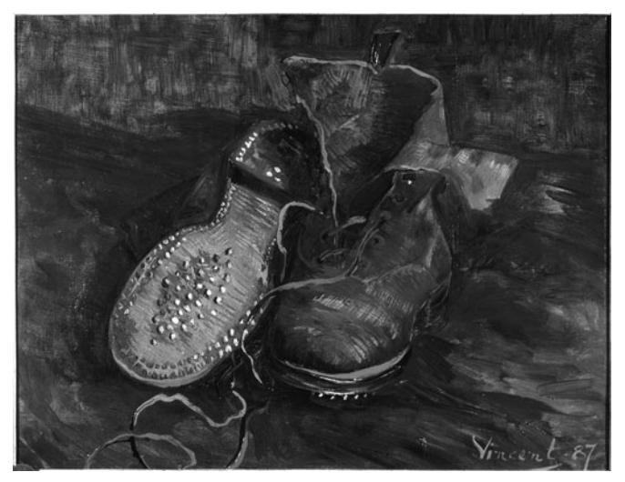
8. Shoes, a painting by Vincent van Gogh