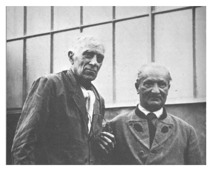
5. Heidegger with Georges Braque, Varengeville, 1955

disclosing the world of a film conveys the mood of the film – contentment, excitement, anxious expectancy, or average everydayness. But it is only in films that moods need music. We bring our own moods to the world without special aids.