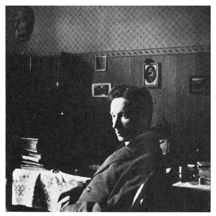
3. Heidegger in the spring of 1912

Being acquired further accretions and refinements in its later history; it acquired, for example, the medieval distinction between being as essence and being as existence, which does not emerge clearly in Aristotle. But enough has been said to set the stage for Heidegger. He agreed with Aristotle that there were different types of being, if not exactly different senses of 'being'. He introduces for this a third term alongside 'that'-being, the fact that something is or exists, and 'what'being, what that thing is: 'how'-being, the mode, manner, or type of an entity's being. For example, if we remain for the moment within the confines of Aristotle's categories, then we have, first, the fact that horses exist, secondly those features of horse that distinguish it from