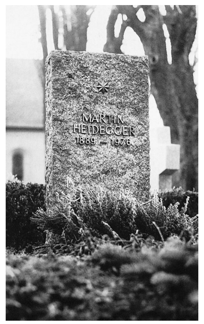
10. Heidegger's grave in the Messkirch cemetery