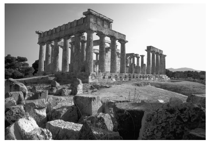
9. The Temple of Aphaia in Aegina, c.500 BCE

unconcealment. Only if beings are unconcealed can we make particular conjectures and decisions. But since we finite creatures never wholly master beings cognitively or practically, there is also concealment. Without concealment there would be no objectivity, no decisions, and no history: everything, the past, the present, and the future, would be wholly transparent to us, leaving no hidden depths to things, and no scope for choices with uncertain outcomes. (The two pairs of opposites, earth-world and concealment-unconcealment, do not exactly coincide. Earth is partly unconcealed, and the world is partly concealed.) Truth happens in the work: 'Setting up a world and setting forth the earth, the work is the fighting of the battle in which the unconcealedness of beings as a whole, or truth, is won' (OWA, 55).