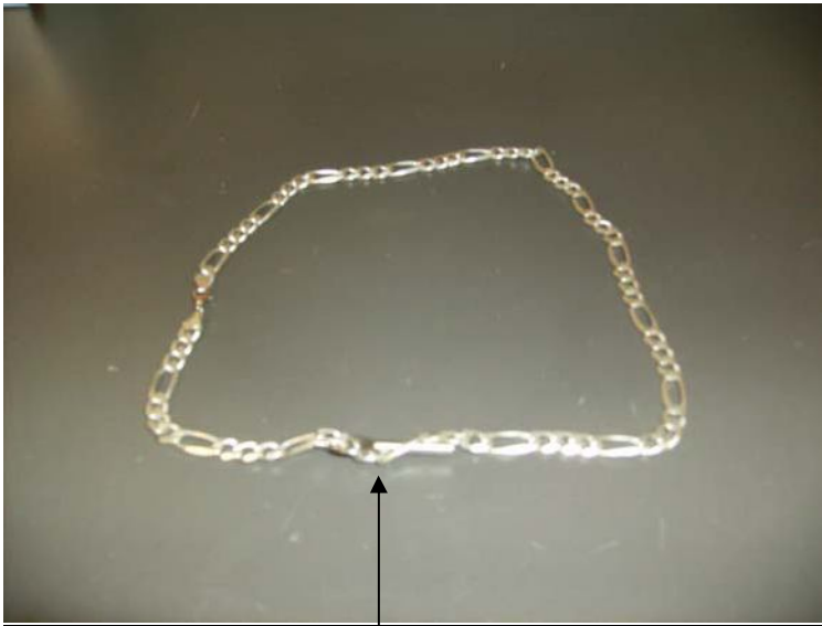
Handcuff key hidden in links.