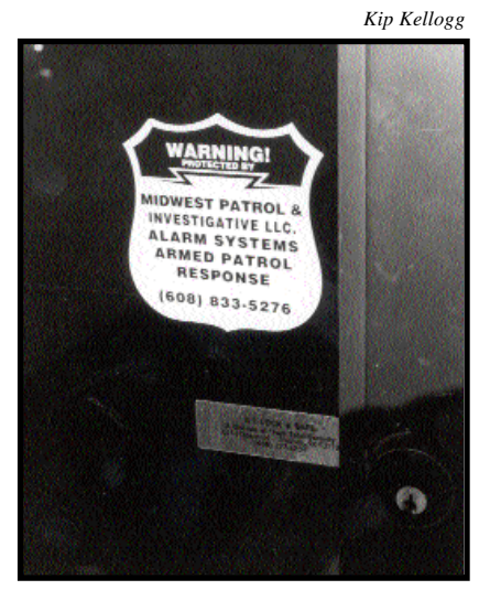
Burglar alarms, private security patrols and safes for especially valuable merchandise, along with signs indicating these security features are present, can all help reduce burglary of retail establishments.

That said, there is some limited evidence from recent studies that target hardening can be effective in preventing burglary of particular premises and, if perceived to be widespread, can also protect an entire area.<sup>28</sup> Which measures to use with which stores depends on a variety of cost, convenience and aesthetic considerations; the advice of a professional security consultant might be required.