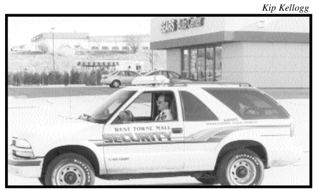
Private security patrols around large shopping malls help reduce burglaries to retail establishments located in and around the malls.

9. Screening and training shop staff. It is good security practice (where law permits) to screen prospective employees for criminal records. It is also good practice to train staff in security measures, to clarify their responsibilities (particularly for key security), and to encourage their involvement–for example, by keeping watch for suspicious behavior and unfamiliar vehicles.