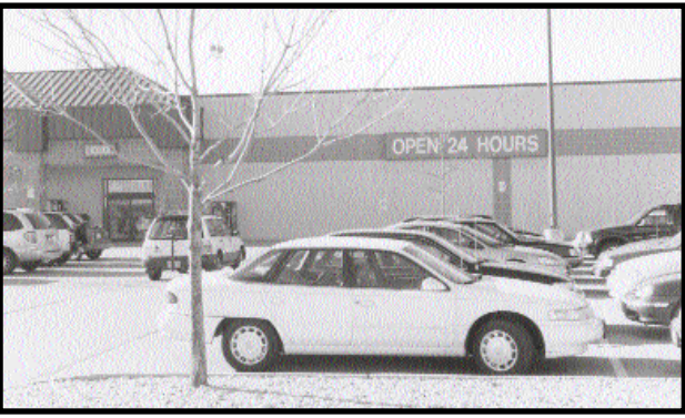
Stores that are open around the clock are protected from burglary by the constant presence of staff.