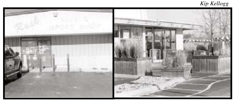
Installing pillars, posts or planters in front of store doors helps prevent burglars from driving vehicles through the doors.