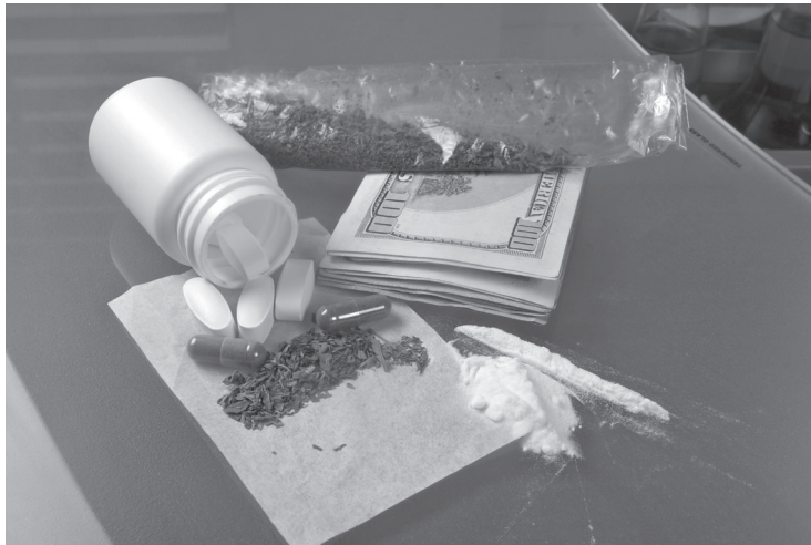
Many home invasion robberies are drug rip-offs in which the drugs or cash are the target.

Yet, home invasion robbery is distinct from these crimes. 2 Street robbery occurs in public or quasi-public space and victims are pedestrians, not occupants. Most residential burglars try to avoid confrontation, but home robbers seek it. Residential burglars who confront and rob unexpected occupants are not necessarily home robbers, because they did not intend to commit robbery when they entered the home. 3