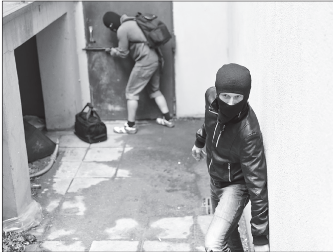
Most home invasions are committed by groups of young men.

In general, victims report home robberies to the police more frequently than street robberies. 55 However, there are several reasons why they might not: victims either are involved in crime, fear repeat victimization or retaliation, or distrust police. 56