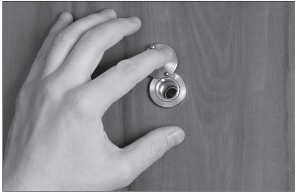
Door peepholes can help prevent home invasions.