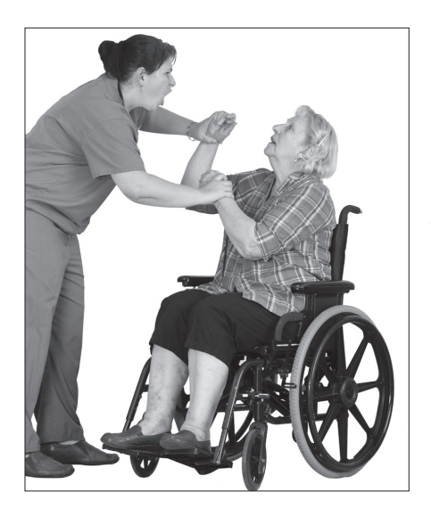
A survey of nursing assistants found that one in six reported engaging in physical abuse and about half reported yelling at residents.

Even though emotional abuse is the most frequent type of elder maltreatment—estimates suggest that approximately one in twenty older persons are emotionally/psychologically abused each year<sup>8</sup>—victims are especially unlikely to report emotionally abusive acts, primarily because there are no visible injuries and they may fear the consequences of reporting.<sup>9</sup>