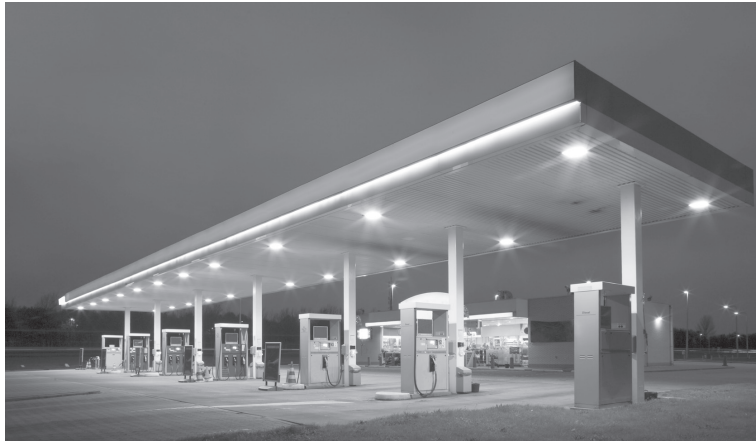
A well-lit pump area may help reduce the risk of gas drive-offs.