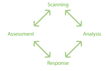
Figure 2: The SARA Model of Problem Solving.

A police department that utilizes community partnerships and problem-solving efforts as part of its efforts to reduce crime and citizen fear of crime has different organizational needs and challenges than a traditional police department that does not engage its community in such efforts. This is because community policing challenges the basic beliefs that were the foundation of traditional policing.<sup>17</sup> The changes that a community policing agency must make in its management, organizational structure, personnel practices, and technology and information systems in support of community policing are referred to as organizational transformation. Such organizational transformation efforts