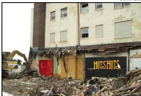
Demolition of a Former Bar and Drug Dealing Hot Spot: Removing a very risky facility can be the best way to reduce crime.