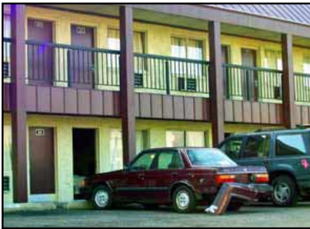
A Low Cost Motel: The risk of crime varies a great deal among facilities of the same type.

When analysts plot the number of crimes at each facility under investigation, they almost always create a graph with a reclining-J shape. This can be seen in the example in Figure 1, based on the work of crime analysts in Chula Vista, California. In that study, all parks over two acres in Chula Vista were ranked from the most crime (on left) to the least. The heights of the bars show the number of crimes in each park. As can be seen, three parks had far more crime than any of the rest and most parks had very little crime.