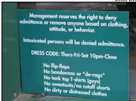
A Sign Outside a Bar: How managers regulate patron conduct can have a big influence on crime risk.