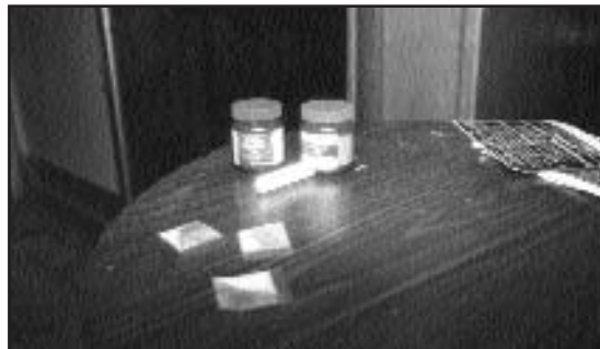
Some ravers inhale mentholated vapor rub to enhance ecstasy's effects.