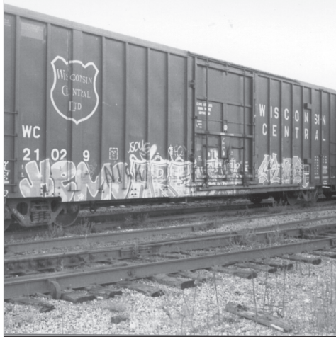
Graffiti is commonly found in transportation systems, such as on the side of this railroad car.

§ Most sources suggest that paint-over colors should closely match, rather than contrast with, the base. Contrasting paint-overs are presumed to attract or challenge graffiti offenders to repaint their graffiti; the painted-over area provides a canvass to frame new graffiti.