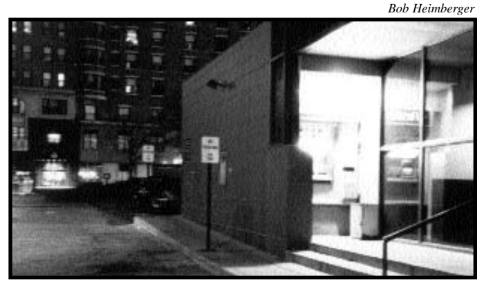
This ATM, located in a poorly lit alley and next to a wall that obstructs the user's side view, does not allow for good visibility.

4. Ensuring the landscaping around ATMs allows for good visibility. Trees and shrubbery should be trimmed routinely to remove potential hiding places for offenders and ensure the ATM is visible to passersby. Slow-growing shrubbery that does not need trimming as often is preferable. Obstacles such as dumpsters, benches or walls that obstruct clear views of the ATM should be removed.