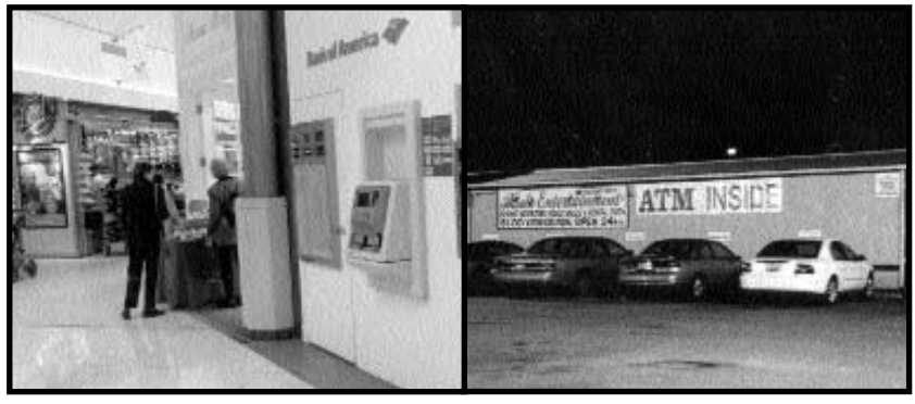
ATMs have been installed in many locations such as this shopping mall and nightclub.