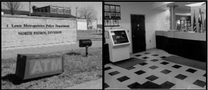
ATMs can be installed in police stations to give users a safe location to conduct financial transactions during nighttime hours.

8. Relocating, closing or limiting the hours of operation of ATMs at high-risk sites. ATM operators should assess crime rates and other measures that suggest the overall risk level of the area in which they are considering installing an ATM. ATMs should not be placed in areas known for drug trafficking and sites near abandoned property or crime-prone liquor establishments. 12 While ATM operators should not avoid placing ATMs in all low-income areas with higher crime rates, it might be reasonable to restrict ATM operation to daylight hours in such areas.<sup>13</sup> ATM operators should consult with local police when choosing sites and notify police of all ATM locations. Local laws should require such consultation as part of the routine site planning and business licensing processes.14