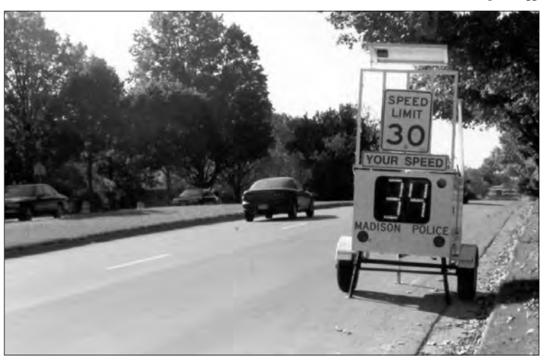
Speed display boards are a cost-effective way to reduce speeds.