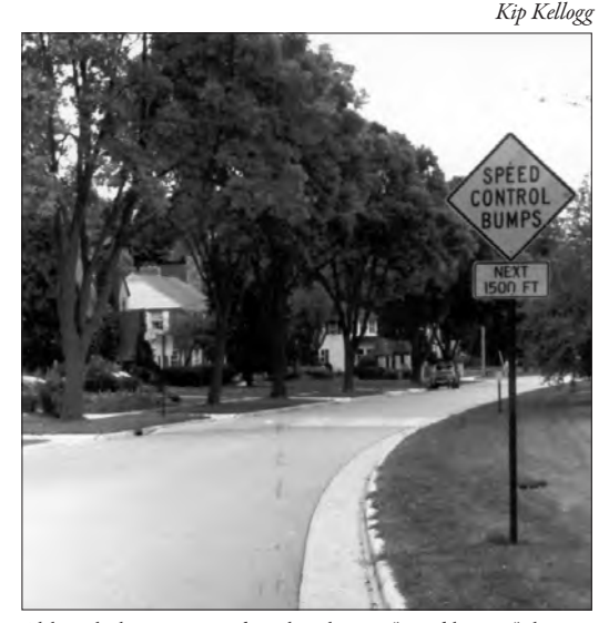
Although the street sign describes them as "speed bumps," these "speed humps" can be crossed safely by cars traveling 20 to 30 mph.

§Some jurisdictions have experimented with placing optical illusions of speed bumps, potholes or other obstructions on the road. These devices tend to have at least a short-term effect of reducing speeds until drivers realize they are illusions. There is an obvious risk that drivers might subsequently come to believe that real obstacles are illusions and fail to slow down when they should.