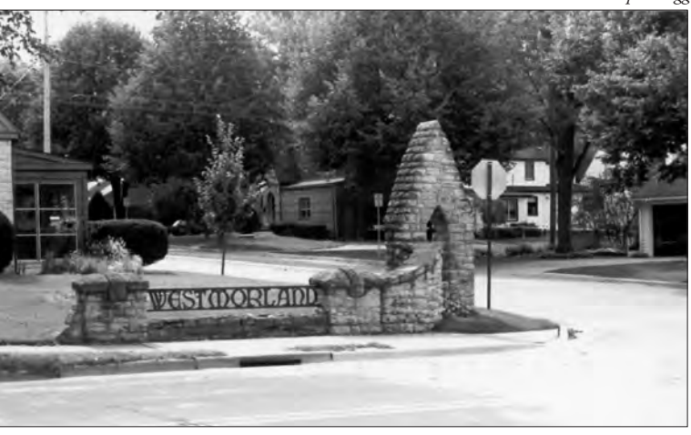
Neighborhood gateways remind drivers that they are entering residential areas where lower speeds are appropriate.