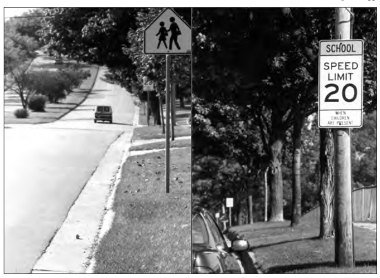
Warning signs such as these pedestrian-crossing and school-zone signs remind drivers to slow down.