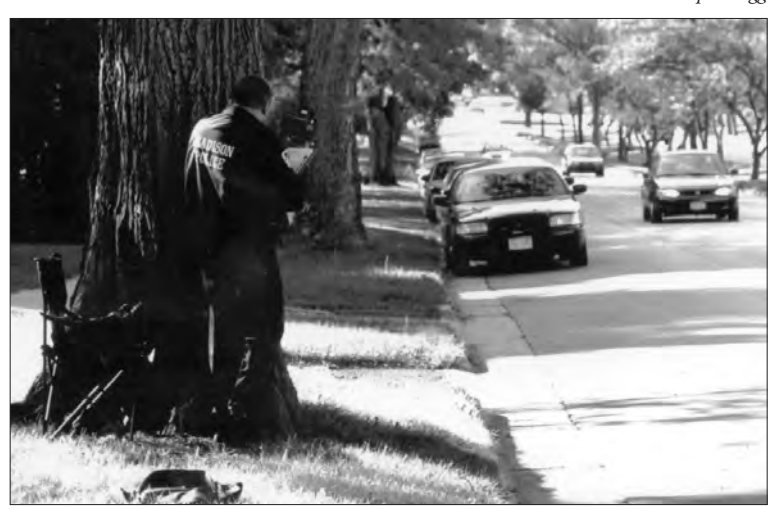
Drivers should not be able to easily detect when and where police are enforcing speed limits.

8. Enforcing speeding laws with speed cameras. Speed cameras, also referred to as photo radar , are cost-effective in reducing speeds, crashes, injuries, and fatalities, particularly when detected violations are prosecuted.<sup>39</sup> Police determined that speed cameras, used in conjunction with other responses, have proved effective in reducing the percentage of speeders, vehicle crashes, injuries, and fatalities in Victoria, Australia.<sup>40</sup> There, police mounted speed cameras either in unmarked police vehicles or on tripods along the roadside, without advance warnings to drivers about the cameras' location. The police could move the cameras around so drivers