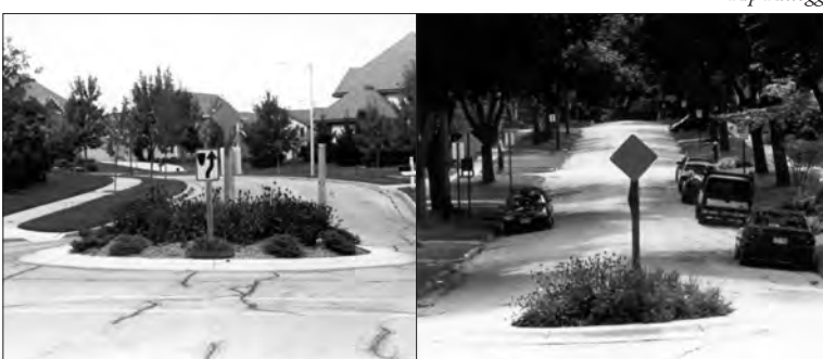
Traffic circles, of varying sizes, reduce speeds and crashes in residential areas.

It is essential that vehicles traveling in the roundabouts have the rightof-way, rather than those entering the roundabouts, for them to be effective in reducing crashes (National Highway Traffic Safety Administration 1999).