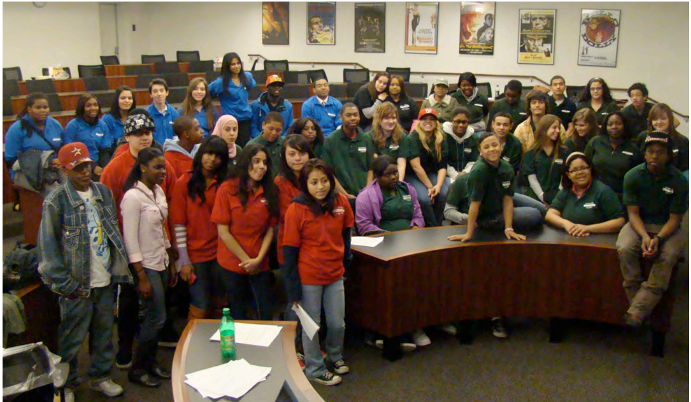
Members of the Center's youth courts at a Law Day celebration at New York Law School in April.