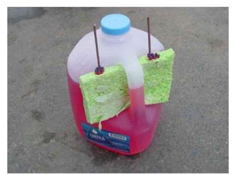
(U) Improvised Incendiary Device

(U//FOUO) Generally, IIDs are improvised more easily and are less expensive to make than improvised explosive devices (IEDs), according to a joint ATF-DHS-FBI Special Assessment.<sup>4</sup>