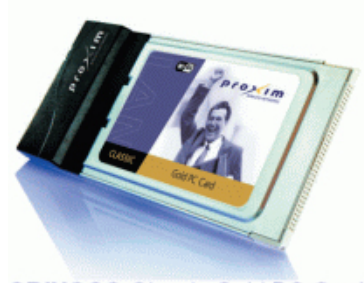
ORINOCO. Classic Gold PC Card

The ORiNOCO 11b/g PC Card gives you the flexibility to connect to any 802.11b or 802.11g wireless network. Just plug the 11b/g PC Card into the Cardbus slot of your notebook computer and you have everything you need for maximum wireless productivity in an enterprise, public building or at home. The 11b/g PC Card is part of ORiNOCO's nice family of client and infrastructure products - everything you need to work anytime, anywhere and the way you want.