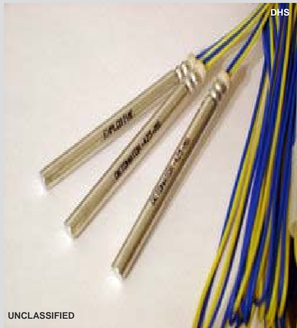
(U) Figure 4: Common electrical detonators.

(U//FOUO) The initiator, also known as a blasting cap or detonator shown in Figure 4, historically was believed to be the most critical component for constructing an improvised explosive device. A blasting cap is a small explosive device containing primary explosives that is used to detonate larger quantities of less sensitive secondary explosives. Blasting caps are used in commercial mining and demolition and in military applications.