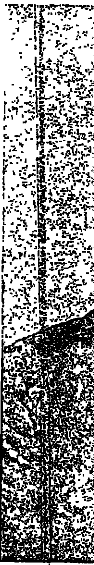
Lather Witke, durm

Waberski C. phineas copy of the Waberski cipher message I gave Cap Stanley a copy of the Waberski cipher message