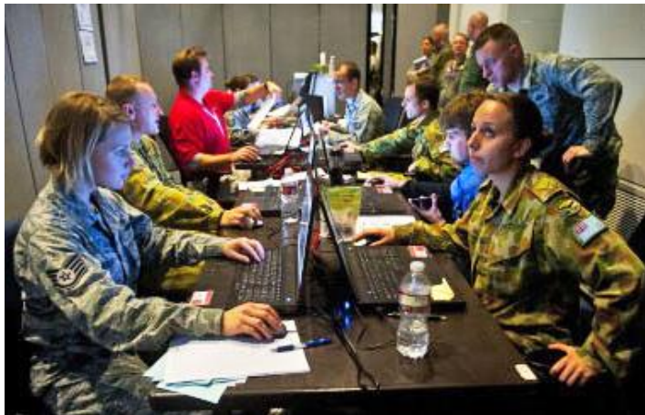
The Red Flag 14-1 Cyber Protection Team works on cyber defense procedures inside the Combined Air and Space Operations Center-Nellis, Nellis, NV. The CPT's primary goal is to find and thwart potential space, cyberspace and missile threats against U.S. and allied forces.

planned release of a satirical film, North Korea conducted a cyberattack against Sony Pictures Entertainment, rendering thousands of Sony computers inoperable and breaching Sony's confidential business information. In addition to the destructive nature of the attacks, North Korea stole digital copies of a number of unreleased movies, as well as thousands of documents