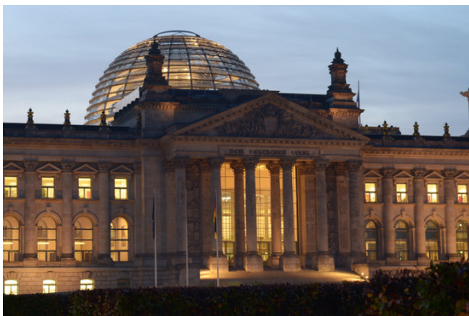
German politicians are considering a draft law regulating Internet security. Shown, the Reichstag Building, home of the German Parliament.

BERLIN—German politicians are debating a new Internet-security law that could exclude U.S. technology companies from Germany's digital economy, a sign Berlin is beginning to press its commercial advantage after revelations of spying by the NSA.