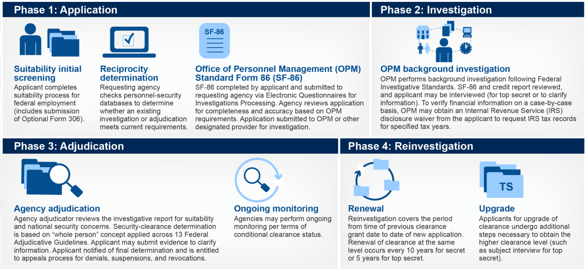
Figure 1: Security Clearance Process

As shown in figure 1, to ensure the trustworthiness and reliability of personnel in positions with access to classified information, government agencies rely on a personnel security clearance process that includes multiple phases: the initial application, investigation, adjudication, and reinvestigation (where applicable, for renewal or upgrade of an existing clearance).