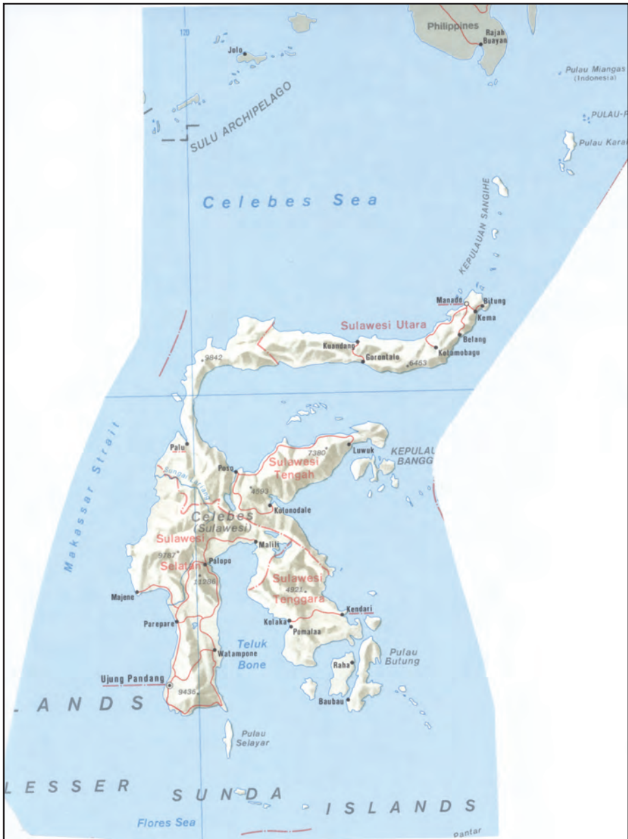
Map of Sulawesi.