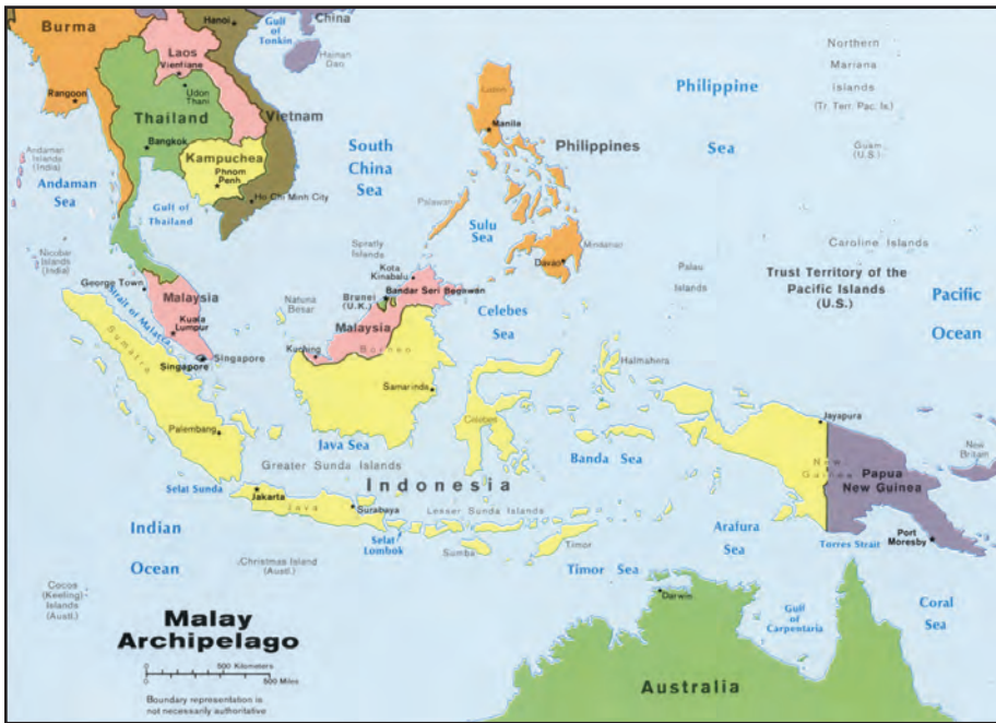
The Malay Archipelago, a region more commonly known as Southeast Asia.