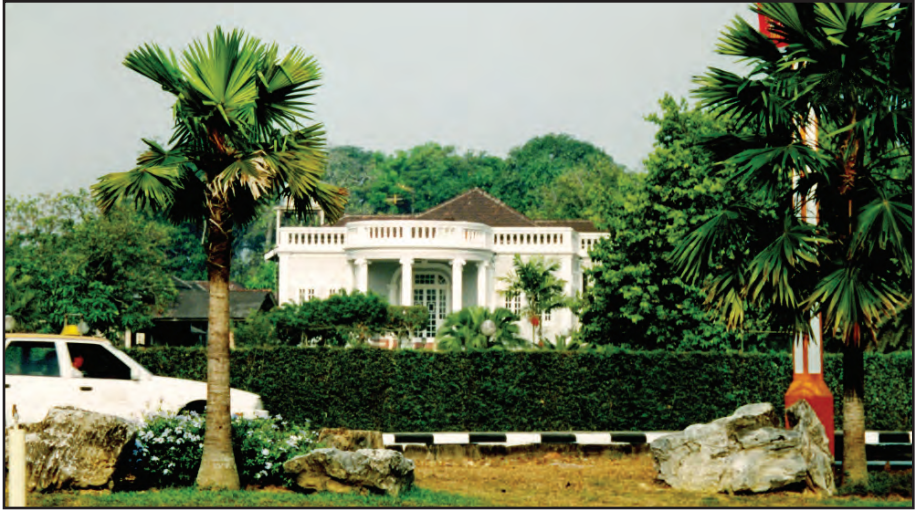
Sultan's palace in Kota Baru, Malacca, Malaysia, March 2004.