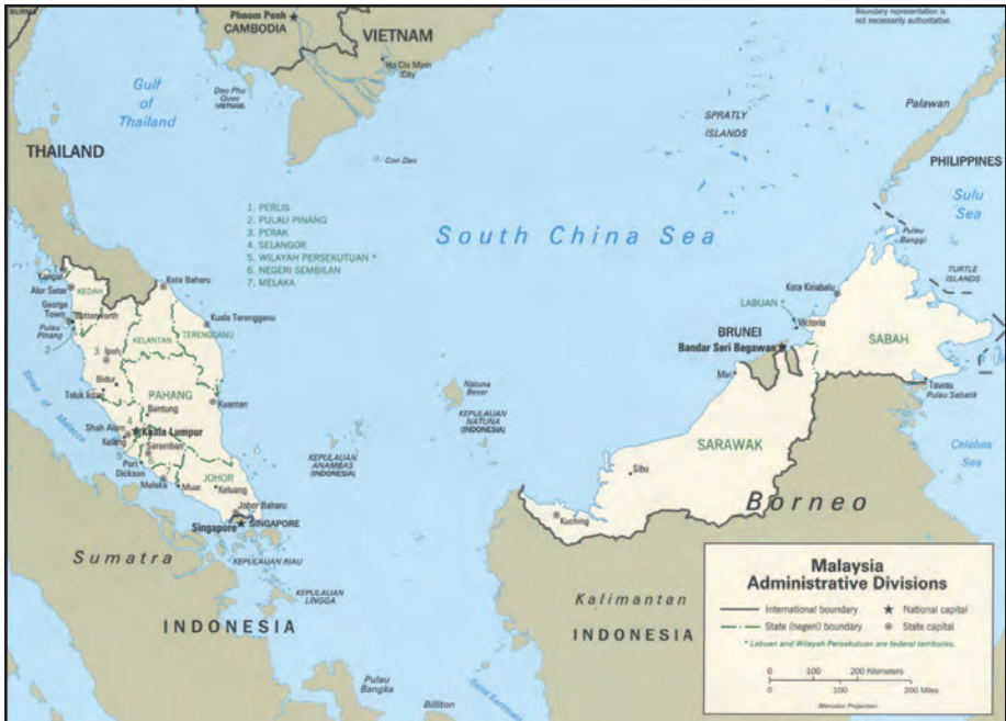
Map of Malaysia