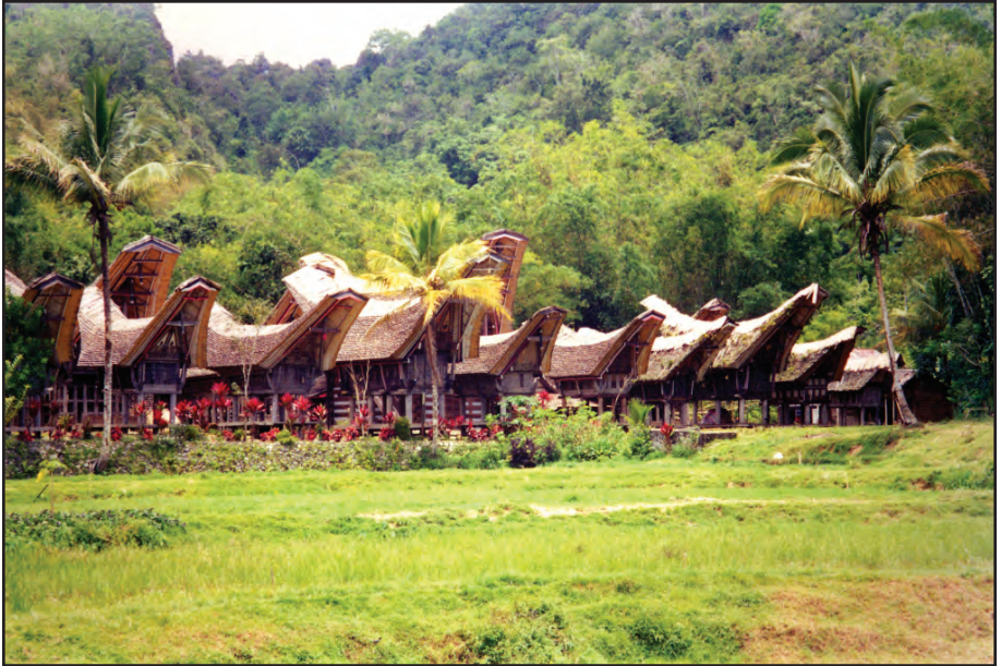
Traditional Tongkanan rice barns in southern Sulawesi.