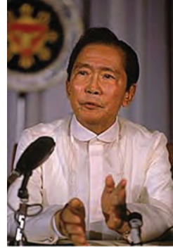
Ferdinand Marcos, controversial long-time President of the Philippines from 1965 to 1986.

The second shock arrived on September 21, 1972, when President Ferdinand Marcos declared martial law throughout the Philippines. Although the communist-inspired New People's Army (NPA), established in 1968, was a growing threat, it did not yet constitute the challenge to government authority posed by the Huk rebellion, its predecessor movement in the 1950s, and the proclamation of martial law only strengthened the appeal of the NPA within the country. 489 The primary reason for Marcos' action appears to have been to lay the basis for arresting and detaining about 30,000 individuals whom he considered part of his political opposition, including rival politician Benigno Aquino. 490 In publicly stating his rationale, however, he gave the principal reasons for the declaration of martial law the existence of armed conflict between Muslims and Christians and a Muslim "secessionist movement" in the southern Philippines. 491 From the perspective of the Moros, the declaration was the final straw. It was a declaration of war against a defeated people who now had no option except that of resistance.