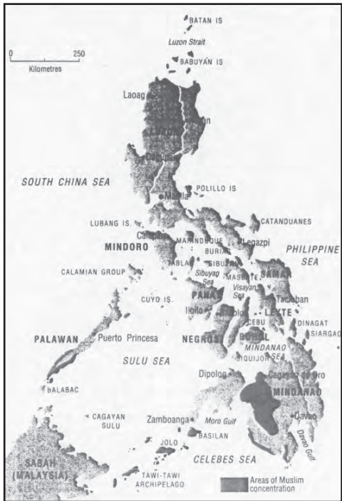
Map of the Philippines showing areas of Muslim concentration.

the largely Protestant orientation of most U.S. administrators led many of them to view the historically dominant role of the Catholic Church in the Philippines with