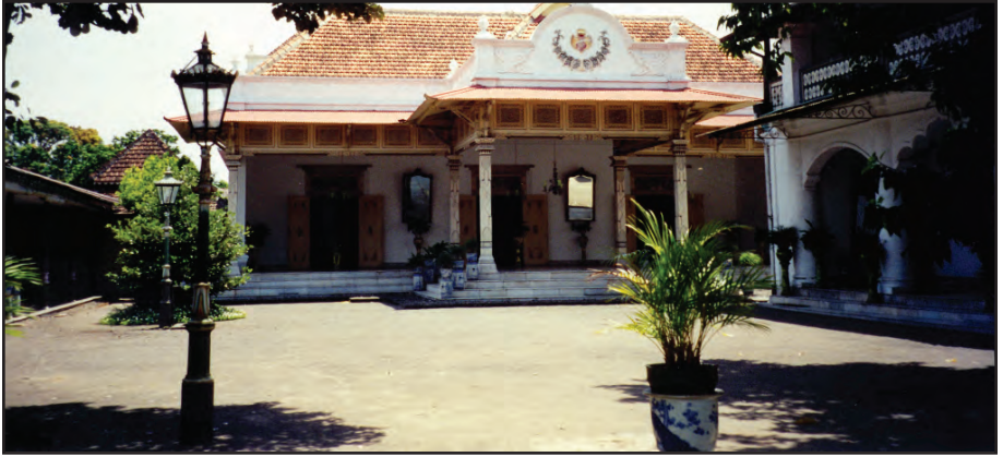
Sultan's palace in Jogjakarta, Java, Indonesia, September 2000.