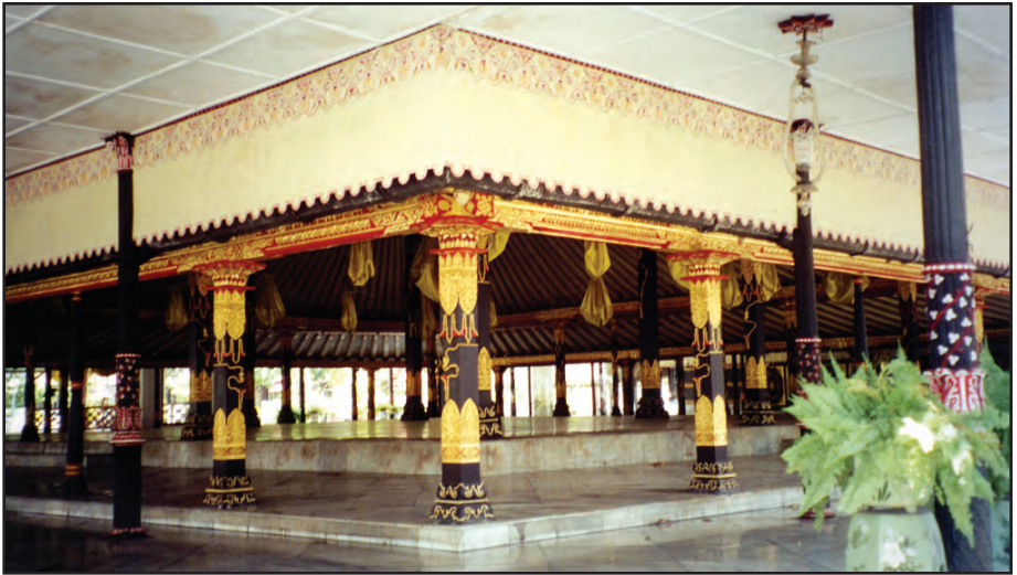
Typical interior room at the Sultan's palace, in Yogyakarta, Java, Indonesia, September 2000.