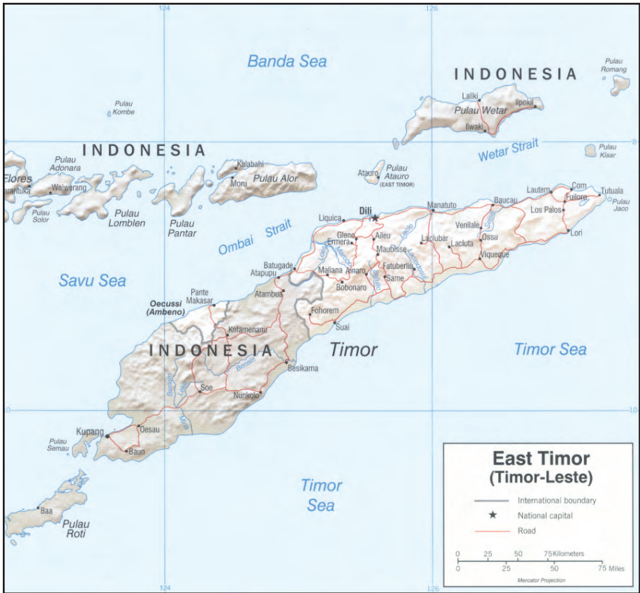
Map of East Timor, long claimed by Indonesia and now a UN protectorate.