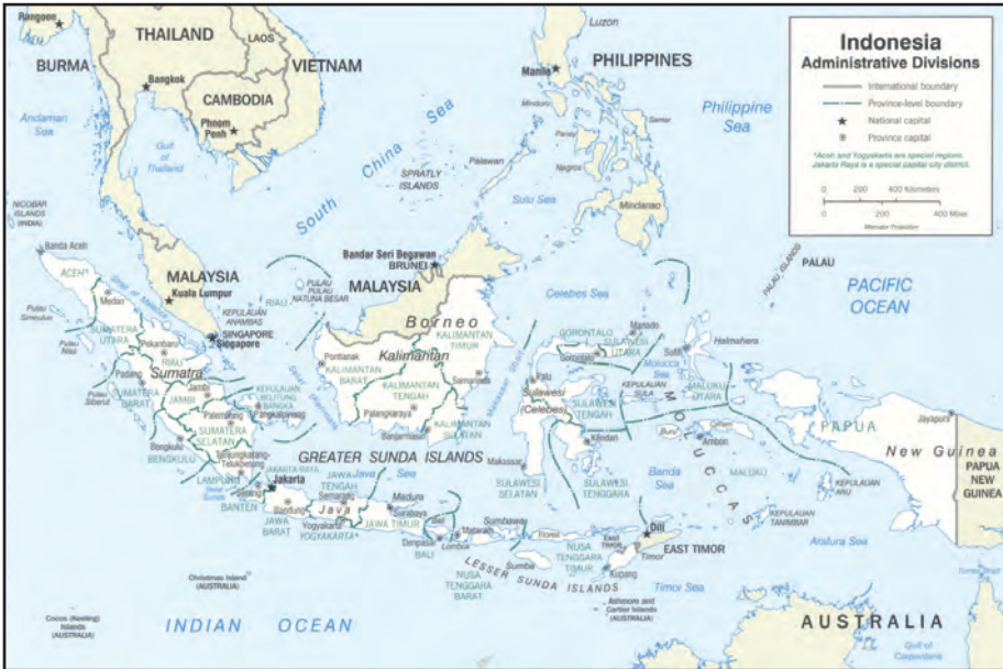
Map of Indonesia.