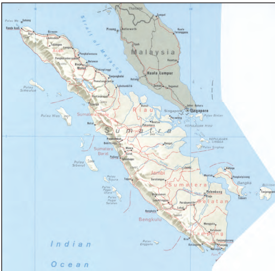
Map of Sumatra indicating the Aceh region of Indonesia.

By far the fiercest and most bitter separatist conflict in Indonesia has been that in Aceh, in the far west of the archipelago. Unlike the separatist movements in Maluku, Papua and East Timor, which have a Christian-Muslim religious as well as an ethnic dimension, however, Aceh is a profoundly Muslim region. Part of its rationale for independence, or at least an autonomous status, has been that Indonesia, with its Pancasila ideological basis, is widely perceived to be insufficiently Islamic for Aceh to be a part of it. For this reason, the Acehnese leadership during the early independence period, headed by Daud Beureueh, associated themselves with the Darul Islam