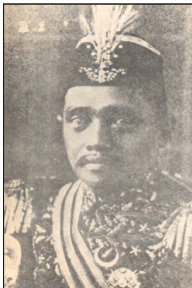
Photo of the Sultan of Sulu, Jamal al-Karim II, who signed an agreement with U.S. forces in 1898 pledging neutrality in the U.S. — Philippines conflict in return for a U.S. pledge of non-interference in the affairs of the Muslim population of Mindanao and the Sulu archipelago.

Almost immediately, in 1903, efforts were begun to implement the provisions of the Organic Act. For the Moro province, like the others, these provisions meant an abolition of slavery; the establishment of new schools in which a new non-Muslim curriculum was provided; the construction of a new provincial government headed by a governor appointed from Manila, whose authority totally bypassed and undercut that of the historic sultans ; and the traditional datus , 457 who viewed themselves as sovereign rulers and substituted a new legal system that replaced and totally ignored the shari`a . From the standpoint of the Moros, but especially their traditional datus , American policy in the Philippines was quickly perceived as more destructive and subversive to traditional culture than Spanish rule had ever been. Accordingly, U.S. authorities governing the Philippines soon found themselves faced with a second insurrection against their presence in the southern Philippines, one even more fierce than the first. The Moro insurrection that got underway just as the first insurrection was being quelled continued until 1914, when U.S. forces finally were able to conclude that the