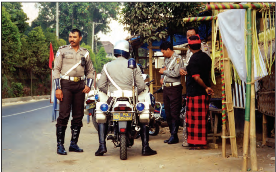
Local police post in Bali in 2000. This was the site of the Jemaah Islamiyah-sponsored bombing of a nightclub in October 2002, which killed scores of tourists.