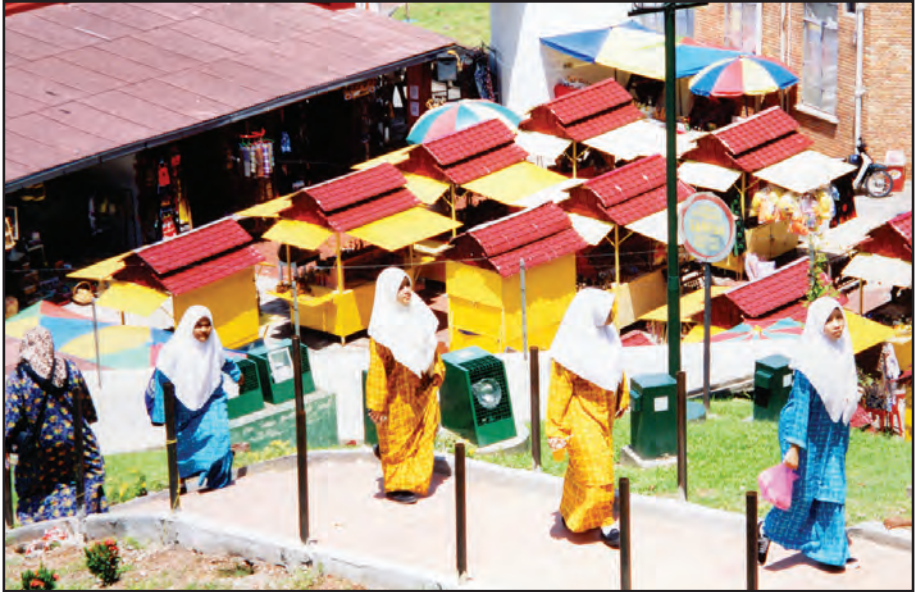
Muslim tourists at St. Paul Hill, Malacca, Malaysia, May 2001.