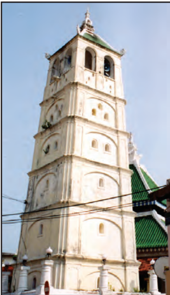
Kampung King Mosque in Melaka, across Strait of Malacca from Sumatra, Indonesia, March 2004.

With the election of 2004, the UMNO and the Barisan Nasional continued to maintain the strong grasp on Malaysian politics it had held since the country gained independence in 1957. Challenged by a revival of Islamic sentiment since the 1970s, the party responded by co-opting Islamic values into its mechanism of governance. However, it had sought to embrace a vision of Islam that coexists with rapid economic development and prosperity. As a result, those with a more “fundamentalist” orientation have continued to be marginalized politically. This pattern is likely to endure for the foreseeable future. The Chinese and Indian elements of the electorate almost guarantee it, as does the ever growing urban, middle class Malay sector. As the 1995 landslide election of UMNO helped to give birth to the militant KMM movement, the frustrated reaction of the same PAS-related elements may give birth to a renewed militant element following the 2004 election. The regime is more alert to the threat to political stability posed by such a development in the post-9/11 world. Malaysian politics is likely to continue to be a rocky road, but continuity is likely to prevail over discontinuity—as it has in the past—for the foreseeable future