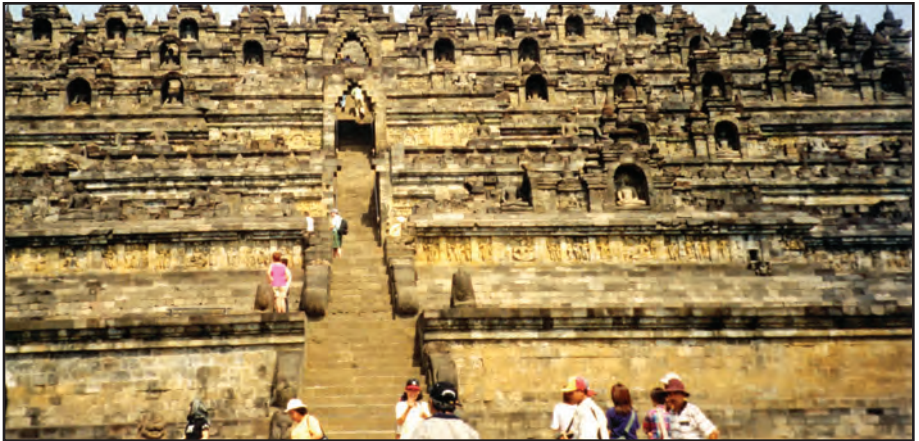
View from the base of Borobuder Temple in Yogyakarta, Java, Indonesia, September 2000.