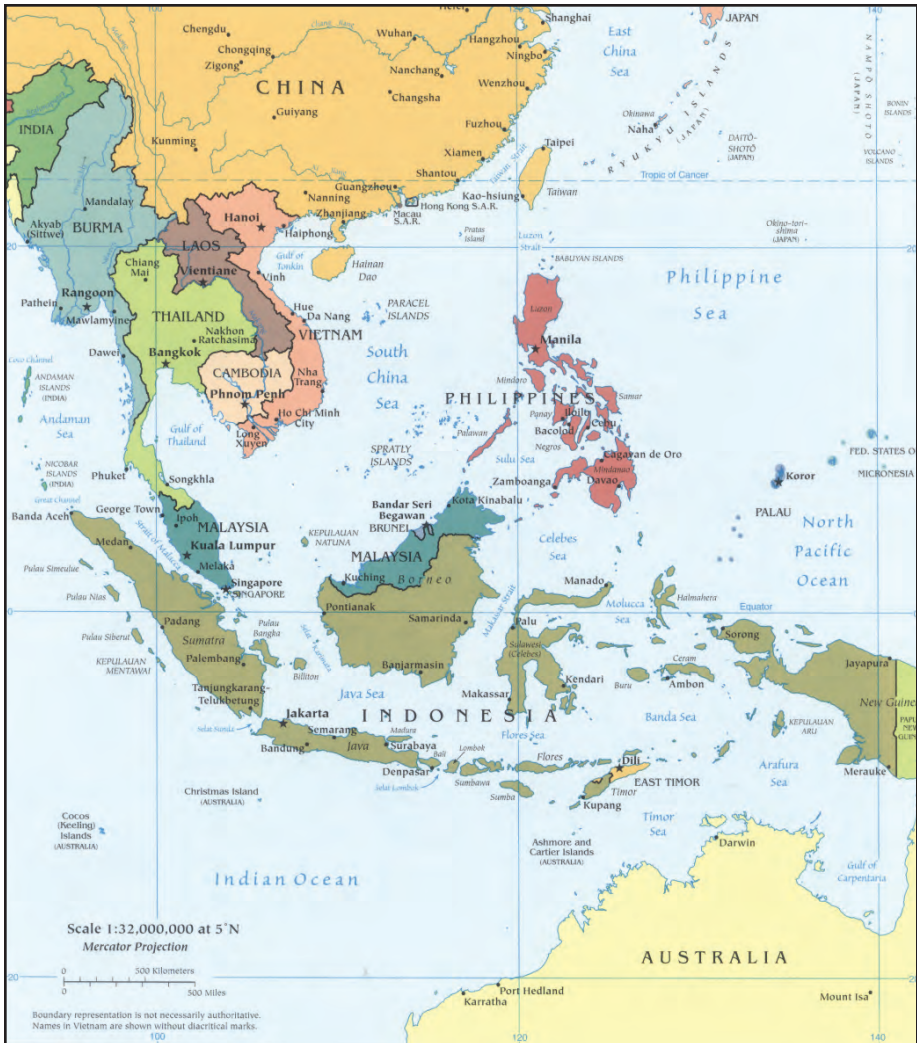
Map of Southeast Asia today.