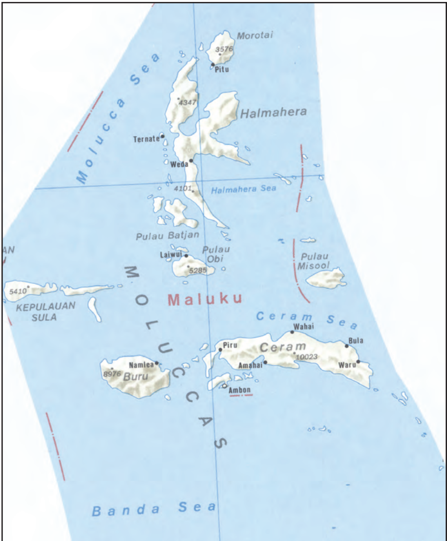
Map of the group of Indonesian islands known as Maluku.