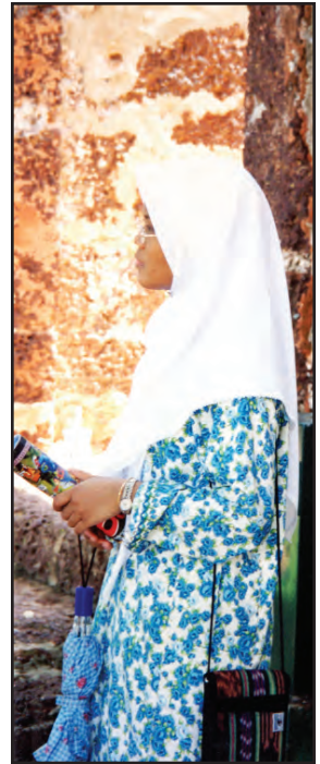
Muslim woman dressed in traditional garb, Malacca, Malaysia, May 2001.

Very quickly after the co-optation of Anwar Ibrahim into the UMNO, a number of measures aimed at strengthening Islamic values in Malaysian society began to be implemented. Among these were the establishment of an Islamic bank, the International Islamic University of Malaysia (IIUM), 57 an Islamic insurance company, a network of Islamic pawn shops, a ban on gambling, a ban on the import of beef not slaughtered in accordance with Islamic rules, greatly increased Islamic content on radio and television, introduction of Arabic script ( jawi ) into the primary school curriculum, the suspension of the government-run meal program in public primary schools during the month of fasting ( Ramadan ), mandatory teaching of Islam both in elementary schools and in institutions of higher learning, a ban on smoking in all government offices, and training courses on