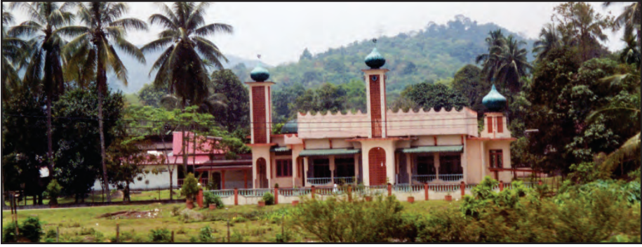
An Islamic mosque in Kota Baru, Kelantan, northern Malaysia, March 2004.