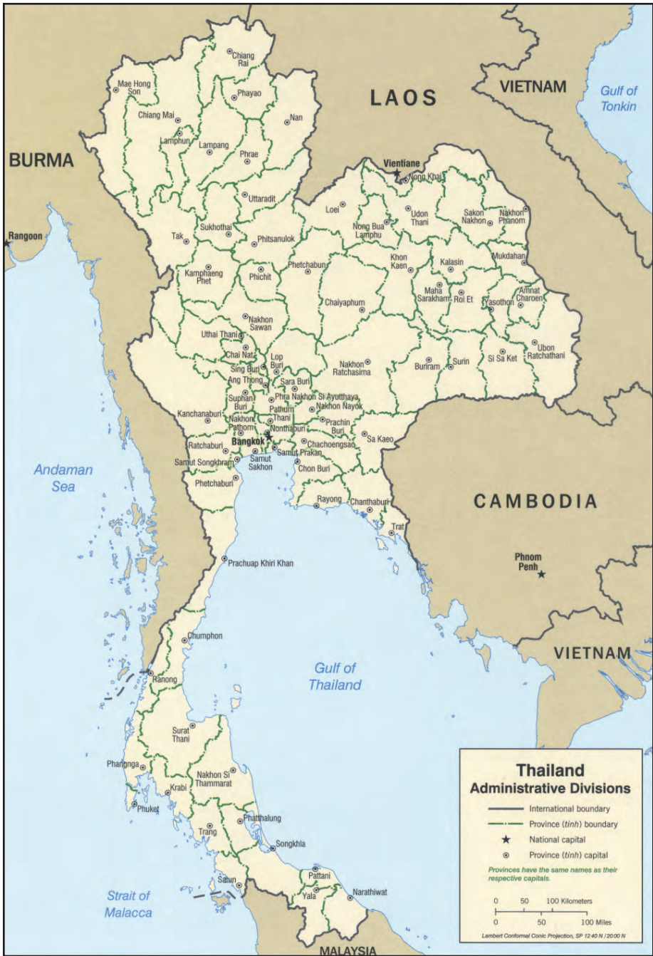
Map of Thailand.