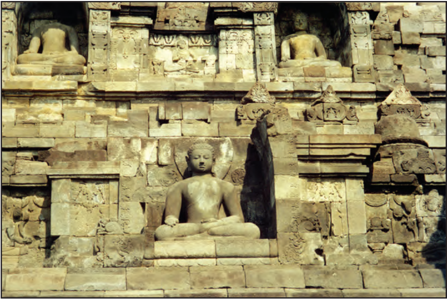
Close-up view of Borobuder Buddhist Temple in Yogyakarta, Java, Indonesia, September 2000.