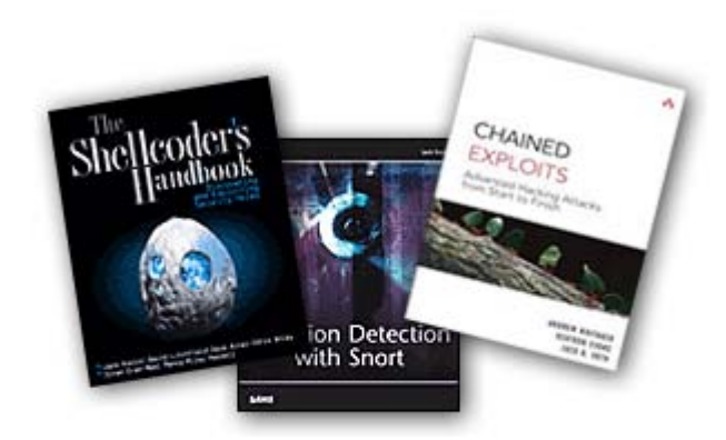
Created and taught by Best-selling Industry Authors