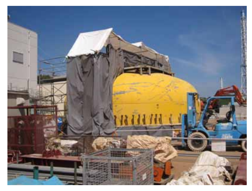
-2 Unit 4 PCV lid being cut off Photo taken by a TEPCO employee on August 27, 2012