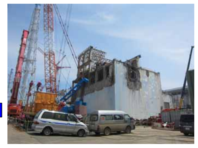
-3 Unit 4 Reactor Building Photo taken by a TEPCO employee on June 18, 2012

Photo taken by a TEPCO employee on January 5, 2012