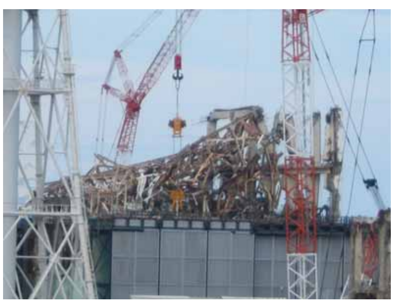
-2 Appearance of Unit 3 (View from the southern hill) Photo taken by a TEPCO employee on September 5, 2012