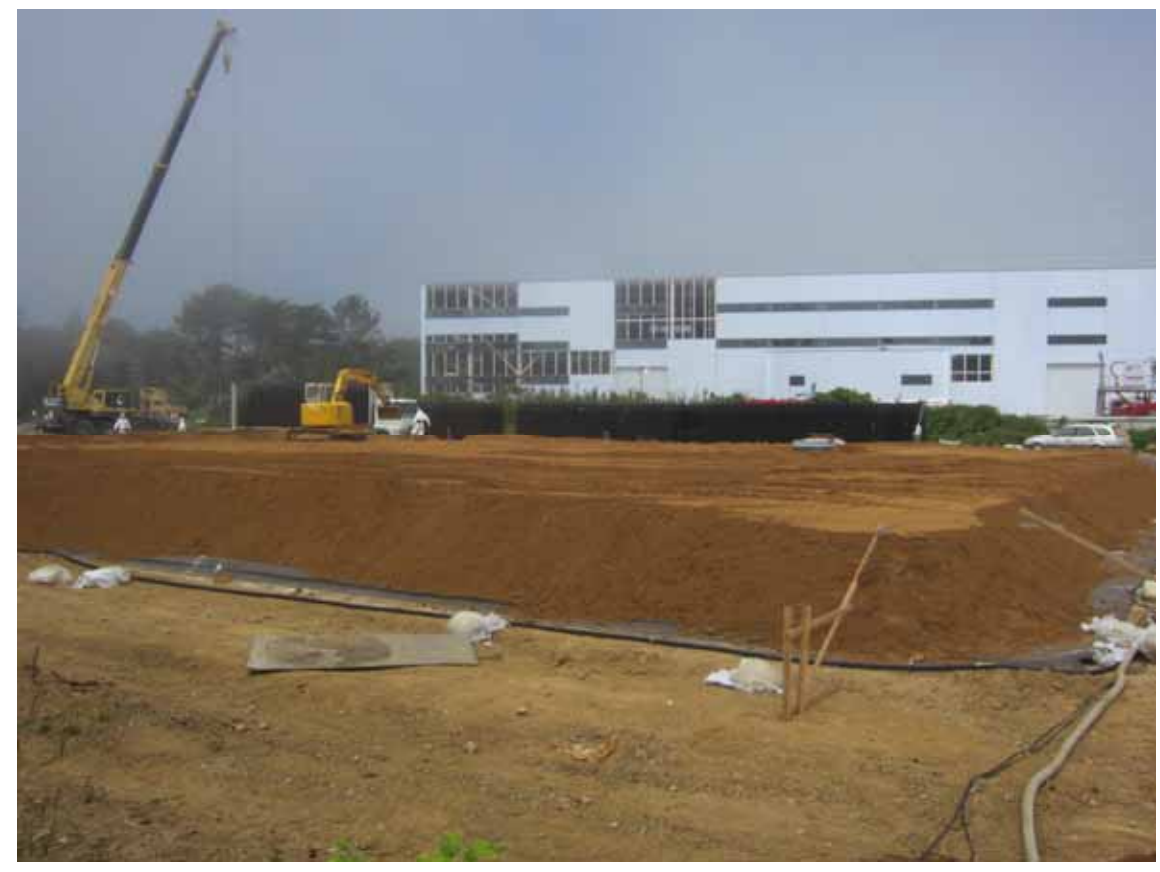
-2 Underground water storage tank installation Photo taken by a TEPCO employee on August 21, 2012

The tank was covered with soil after it was installed.