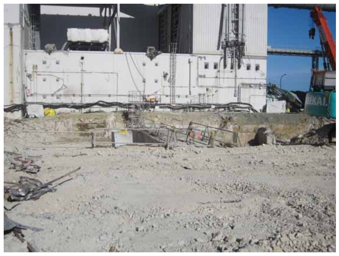
-2 Unit 4 south side foundation improvement work (After completion) Photo taken by a TEPCO employee on September 3, 2012