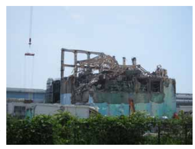
-2 Upper part of Unit 3 Reactor Building Photo taken by a TEPCO employee on June 18, 2012