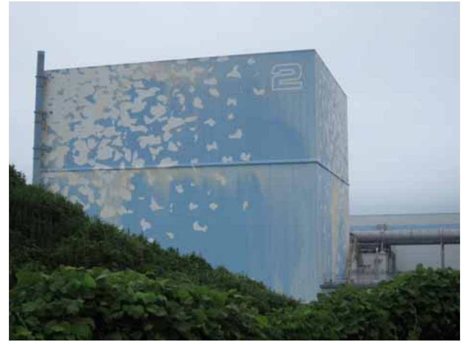
-2 Appearance of Unit 2 (View from the hill on the mountain side between Unit 2-3)

Photo taken by a TEPCO employee on August 15, 2012