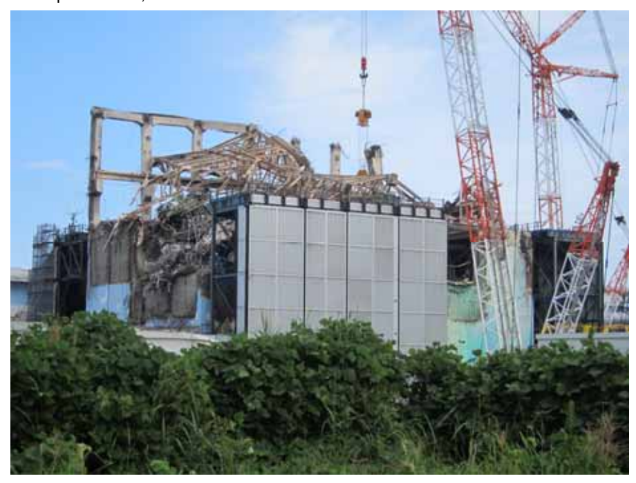
-3 Upper part of Unit 3 Reactor Building Photo taken by a TEPCO employee on September 5, 2012