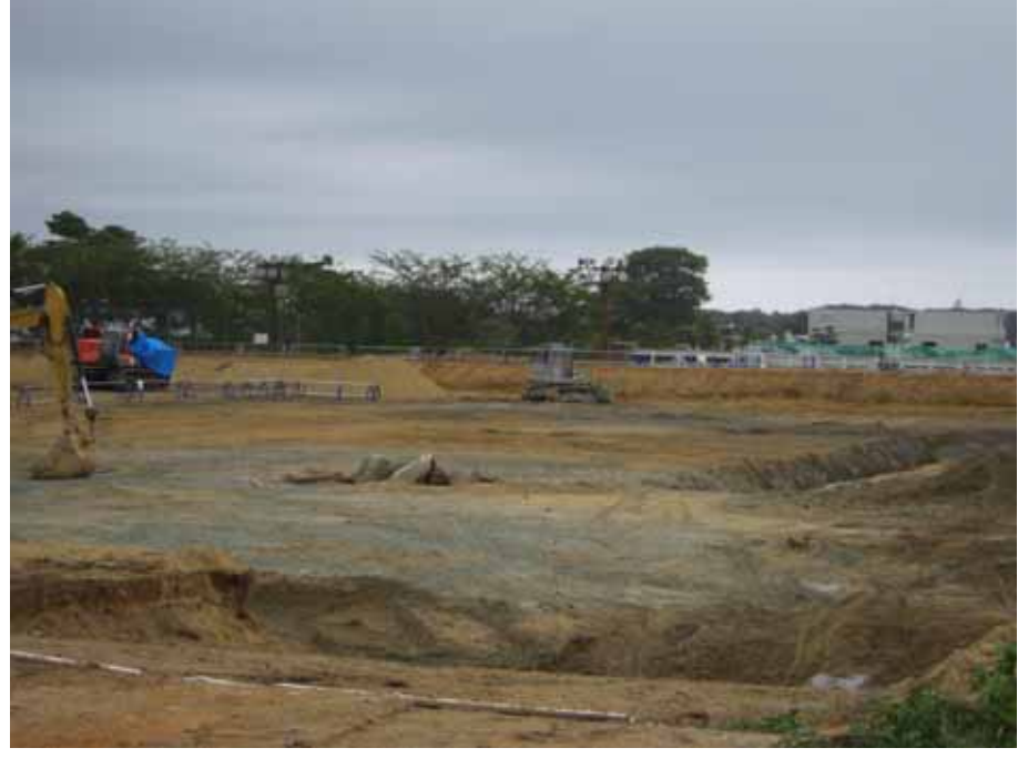
Land development for the dry cask temporary storage facility Photo taken by a TEPCO employee on August 15, 2012

Photo taken by a TEPCO employee on August 21, 2012