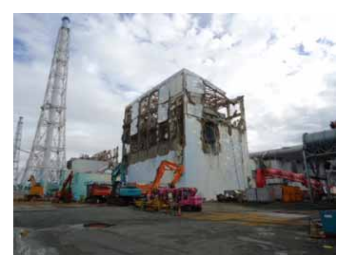
-1 Debris removal from the upper part of Unit 4 Reactor Building (Before removal)

Photo taken by a TEPCO employee on September 22, 2011