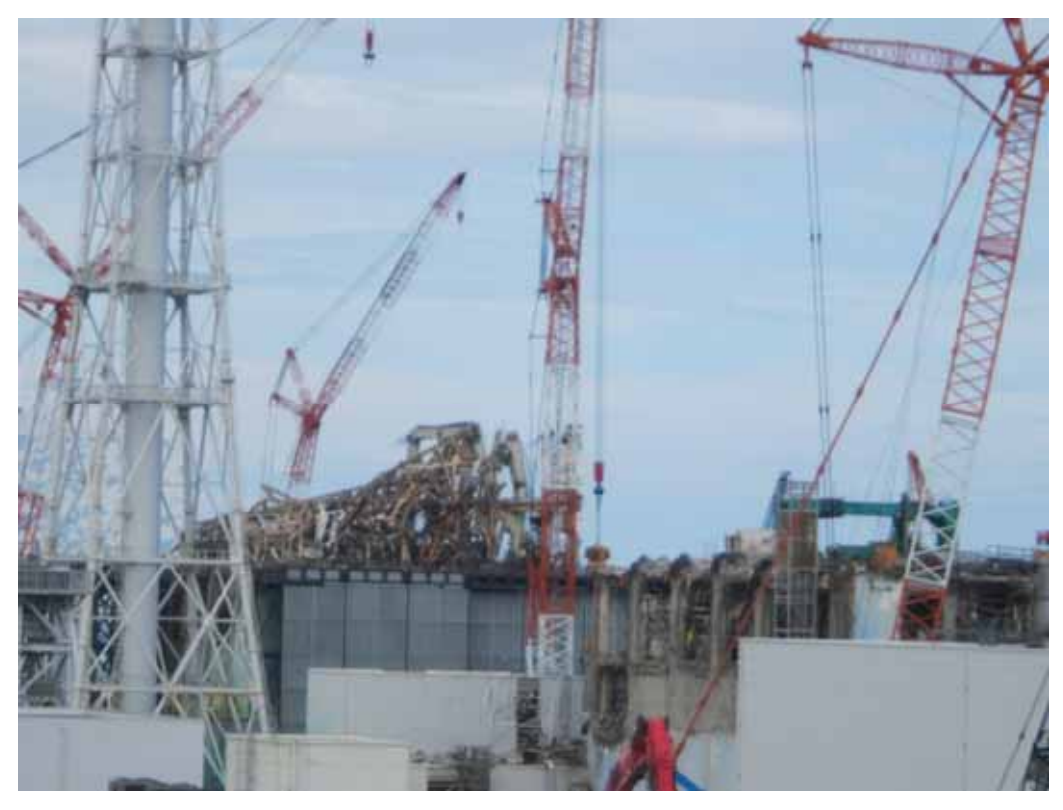
-1 Appearance of Unit 3-4 (View from the southern hill) Photo taken by a TEPCO employee on September 5, 2012