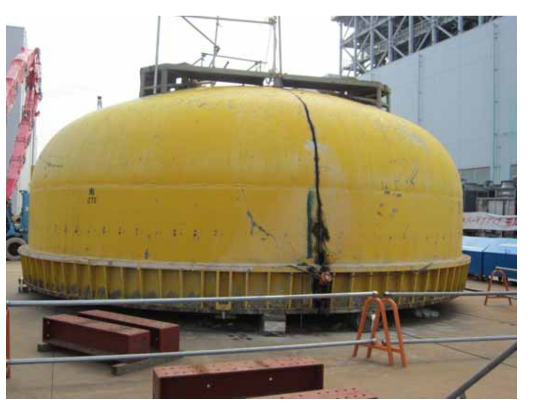
-3 Unit 4 PCV lid (After being cut off) Photo taken by a TEPCO employee on September 5, 2012