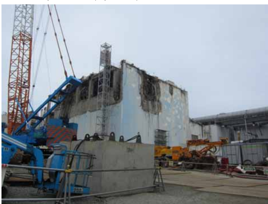
-4 Unit 4 Reactor Building Photo taken by a TEPCO employee on August 15, 2012

Photo taken by a TEPCO employee on September 22, 2011