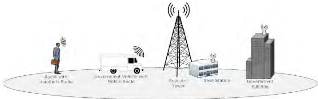
Diagram 1: Basic Components of a Land Mobile Radio System