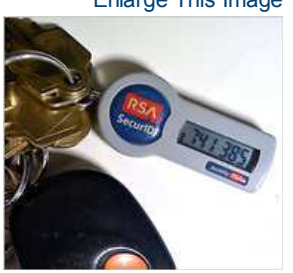
RSA didn't say how its SecurID tokens, carried on key chains and in wallets, were compromised.

RSA, a division of the data management company EMC Corporation, will not say how its system was compromised and what specific kinds of threats its customers are facing. But from its extremely limited disclosure on Thursday afternoon about what might have been taken, customers and computer security specialists are scratching their heads about what the risks may actually be.