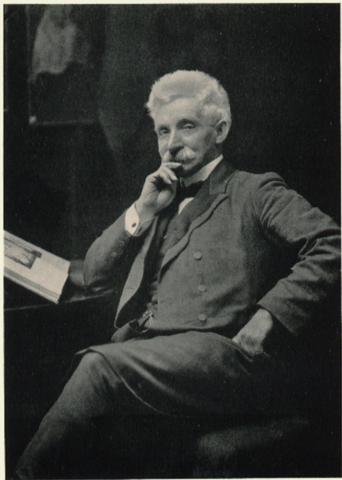
[W. Crooke, Edin.]