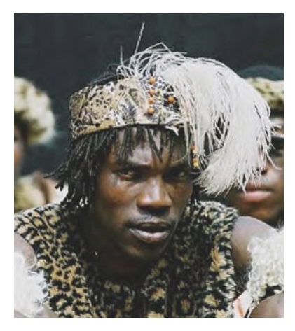
Zulus and Danes . . .

Racially-conscious whites are often frustrated that people of European descent do not understand a simple fact that others take for granted: that it is normal for an ethnic group or race to want to survive and to avoid displacement by others. Unlike people of other races, whites seem to demand some kind of objective, rather