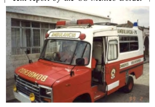
Drive north, and the gringos will pay.

In the United States we live with the comfort of the Emergency Medical Treatment and Active Labor Act, which requires hospitals to provide emergency treatment to any and all comers, regardless of ability to pay. This has been a gift to illegals who, according to a recent report by the US-Mexico Border