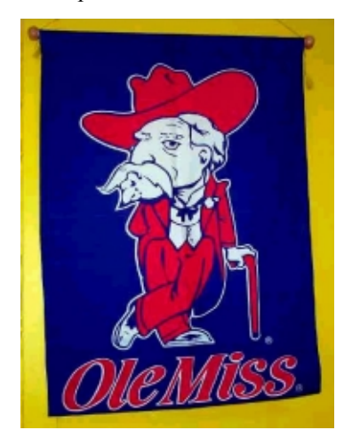
'Colonel Reb' is still the mascot, but for how much longer?

This cannot have fooled anyone. It is just not possible to believe that Trent