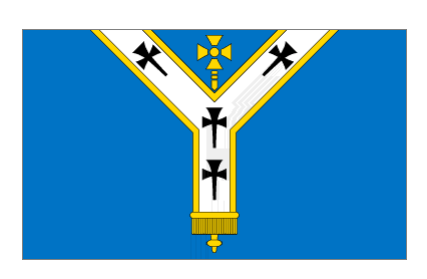
Flag of the Archbishop of Canterbuty, Primate of all England.

In November, 2000, the 580 members of the Church of England's governing synod met in Westminster and approved a recommendation from the Archbishops Council to combat "institutional racism" in the church. The church has set a goal of tripling the number of black and Asian clergy and bishops in the next ten years, and will send all archbishops, bishops, and synod members to sensitivity training. The Church of England does not have its own programs for this