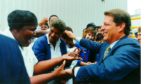
Al Gore with his most loyal supporters.

The party<sup>*</sup> could accomplish this by supporting a long-term moratorium on legal immigration, terminating welfare and other public benefits for immigrants, seeking the abolition of affirmative action, and working for the repeal of "hate crime" laws and the end of multiculturalism. The Republicans could become and remain a majority party by seeking to raise white racial consciousness; they do not need to appeal to irrational racial fears and animosities, but they can and legitimately should encourage white voters to (1) perceive that they as a group are under threat from racial and demographic trends and (2) believe that the Republican Party will support them against this threat.