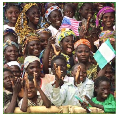
Average IQ of 70?

Critics of g newly returned from another conference in Australia told of the "Abecedarian" Head Start project, which ran from 1980 in North Carolina, and once claimed to have produced IQ gains of up to 25 points. Today, the alleged big gains are forgotten—they were reported only in the very early stages.