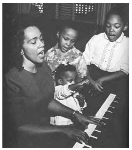
In the days before the gravy train.

lent Social Change. It has some exhibits and a gift shop, but its main job appears to be to cash in on martyrdom. The family's pursuit of money has been so single-minded it has often made it hard